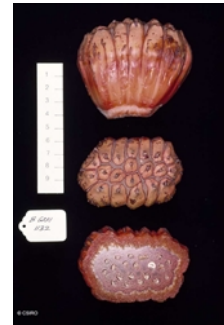
Single fruit segment.