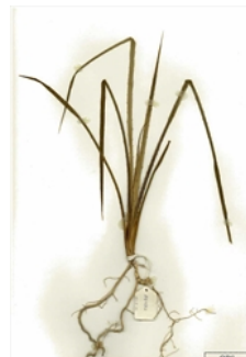
Herbarium specimen of seedling.