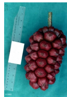
Fruit. © CSIRO

Copyright © CSIRO 2020, all rights reserved.