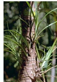
Trunk showing pups.