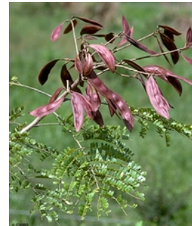
Leaves and fruit.