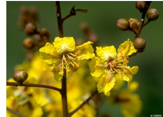
Flowers and buds.