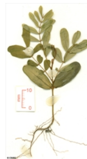
Cotyledon stage, epigeal germination.