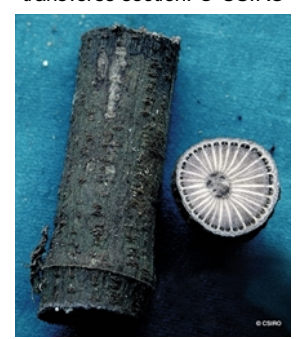
Vine stem bark and vine stem transverse section.