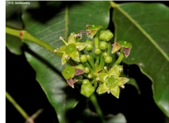
Flowers. © G. Sankowsky