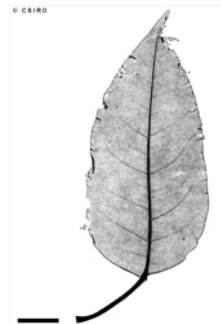
Scale bar 10mm.