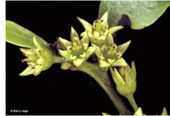
Flowers.