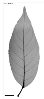
Scale bar 10mm.