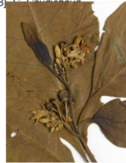
Herbarium specimen: buds, flowers and fruit.