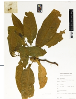
Herbarium specimen.

Copyright © CSIRO 2020, all rights reserved.