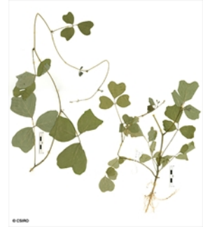
10th leaf stage.