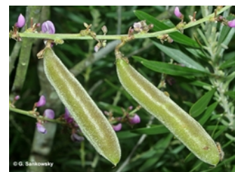
Fruit [not vouchered].