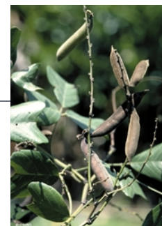
Leaves and fruit.