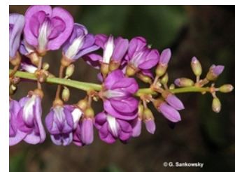
Flowers and buds [not vouchered].