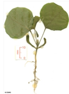
Cotyledon stage, epigeal germination.