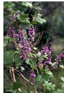
Habit, leaves and flowers.