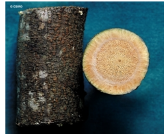
Vine stem bark and vine stem transverse section.