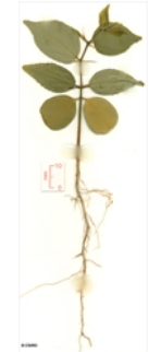
Cotyledon stage, epigeal germination.