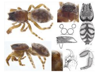
Aspects of the general morphology of Huntiglennia

* The information sheet should be interpreted in the context of the associated diagrams and photographs. Diagrams explaining anatomical terms can be found in the 'Salticidae' pictures at the beginning of the list of genera.