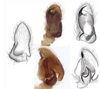
Palp morphology of Huntiglennia