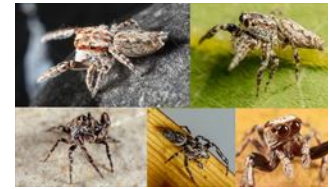
Examples of live Paraphilaeus daemeli Illustrators (and ©) I.R. Macaulay, R. Whyte (R)

* The information sheet should be interpreted in the context of the associated diagrams and photographs. Diagrams explaining anatomical terms can be found in the 'Salticidae' pictures at the beginning of the list of genera.