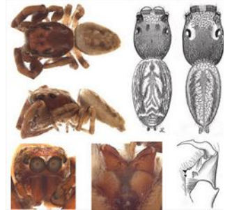
Aspects of the general morphology of Paraphilaeus daemeli