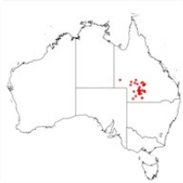
Acacia ensifolia occurrence map. Occurrence map generated via Atlas of Living Australia ( https://www.ala.org.au ).