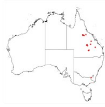
Acacia gnidium occurrence map. Occurrence map generated via Atlas of Living Australia ( https://www.ala.org.au ).