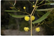
Source: Australian Plant Image Index (dig.16894). ANBG © M. Fagg, 2010