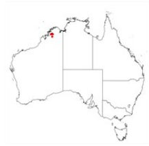
Acacia kimberleyensis occurrence map. Occurrence map generated via Atlas of Living Australia ( https://www.ala.org.au ).