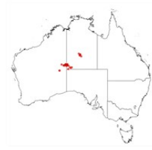
Acacia macdonnellensis subsp. teretifolia occurrence map. Occurrence map generated via Atlas of Living Australia ( https://www.ala.org.au ).