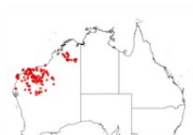
Acacia pyrifolia var. pyrifolia occurrence map. Occurrence map generated via Atlas of Living Australia ( https://www.ala.org.au ).