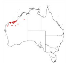
Acacia sphaerostachya occurrence map. Occurrence map generated via Atlas of Living Australia ( https://www.ala.org.au ).