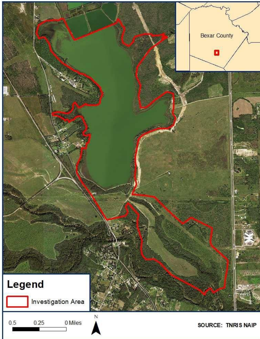
Figure 1. Mitchell Lake Wetlands Quality Treatment Initiatives Project Investigation Area in Bexar County, Texas.

the North American Central Flyway, migrating birds frequently rest and feed at Mitchell Lake. More than 300 migrant bird species, including species federally listed under the Endangered Species Act and 30 species on the Audubon Watch List for declining populations, have been documented at the lake.