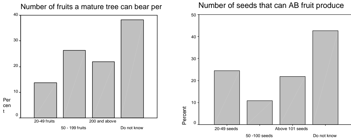
Fig. 3 Showing the percentage response on the number of fruits per tree and number of seeds per fruit.

per season, 26% said 50 – 199 fruits, while 22% said above 200 and 38% said that they do not know (fig 3). When asked about the number seeds per fruits again varied responses were provided. About 24.5% mentioned 20-49 seeds per fruits, 11% said 50-100 seeds per fruits, 22% mentioned above 100 seeds per fruits while 43% said that they do not know (fig. 3).