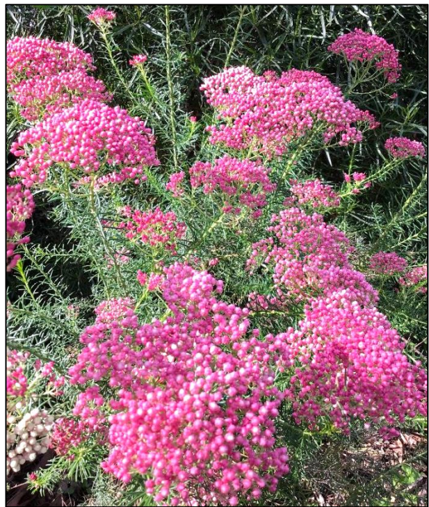
Ozothamnus diosmifolius - a blaze of colour in a mainly green garden.

Acacia iteaphylla , Banksia 'Cherry Candles', B. spinulosa 'Giant Candles', B. ericifolia , Boronia corulescens , Brachiscome multifida , Correa reflexa , C. glabra , C. pulchella , C. 'Fat Bastard!' , B. 'omg' , Crowea exalata 'Edna Walling', C. saligna 'large-flowered form', Eremophila aureivisca , E. cuneata x fraseri , E. folioissima , E. glabra , E. glandulifera , E. hygrophana , E. mackinlayi , E. nivea , E. platycalyx , E. racemose , Eutaxia cuneate , Grevillea 'Bush Lemon', G. 'Peaches and Cream' , G. 'lolipops' , G. presides x fililoba 'Ellabella', Hakea decurrens , H. laurina , Hibbertia vestita , Hibiscus 'West Coast Gem', Kunzia baxteri , Ozothamnus diosmifolius , Philotheca myoporoides 'Winter Rouge', Rhodanthe chlorocephala , Thryptomene saxicola (Payne I), Scaevola aemula , Syzygium australe 'Winter Lights', Verticordia grandis , Westringia glabra , Westringia 'Wynyabbie Gem'