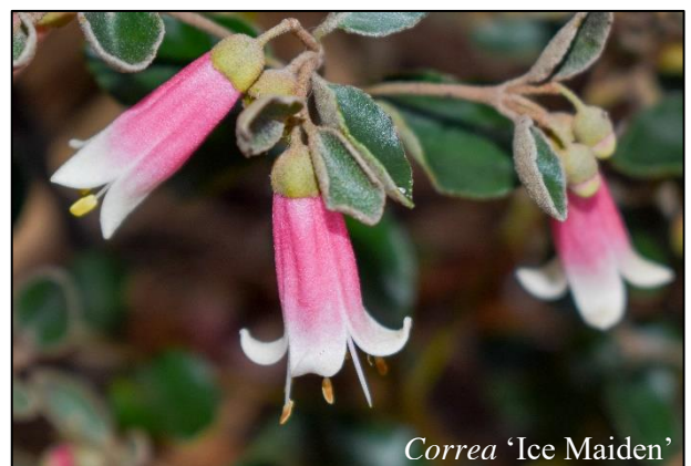
Correa 'Ice Maiden'