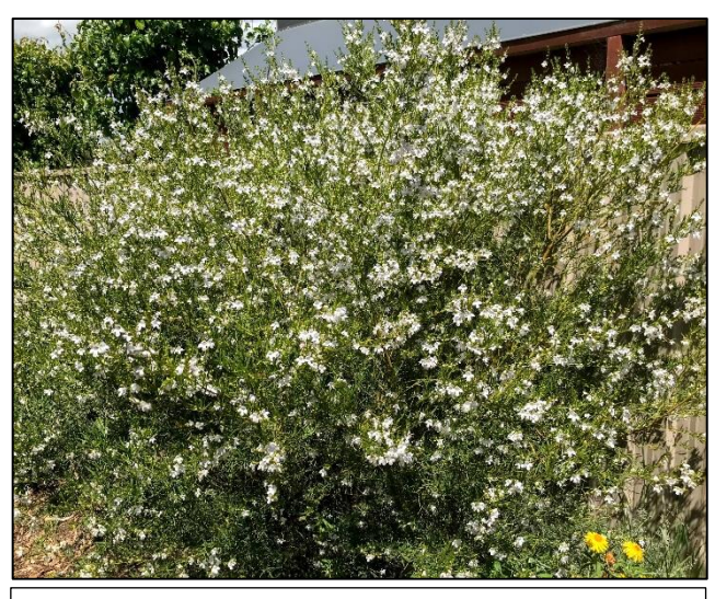
Prostanthera nivea, Snowy Mint Bush