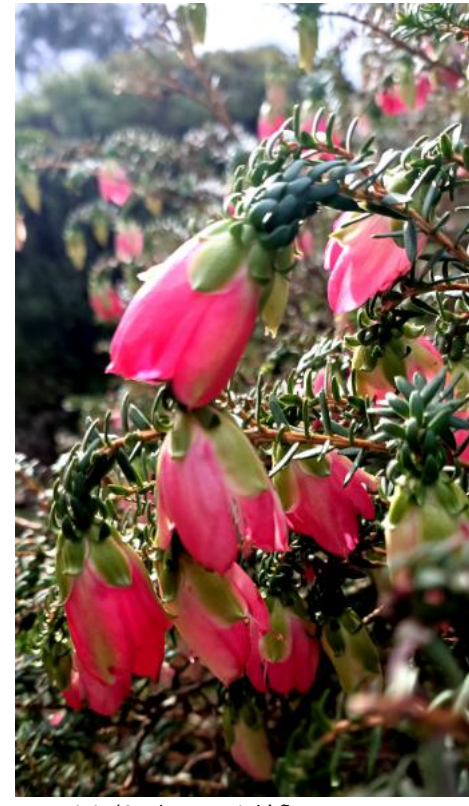
Darwinia 'Coolamon Pink' flowers.