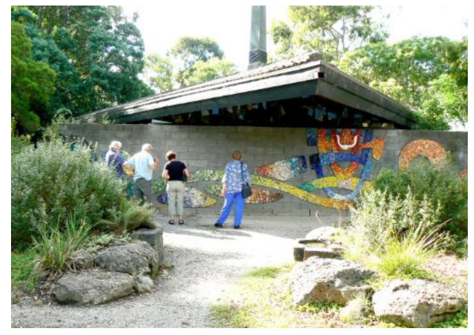
Peace Garden at Warrandyte Uniting Church.

APS Maroondah have many such members too, and this led me to looking for photos of a visit made to the