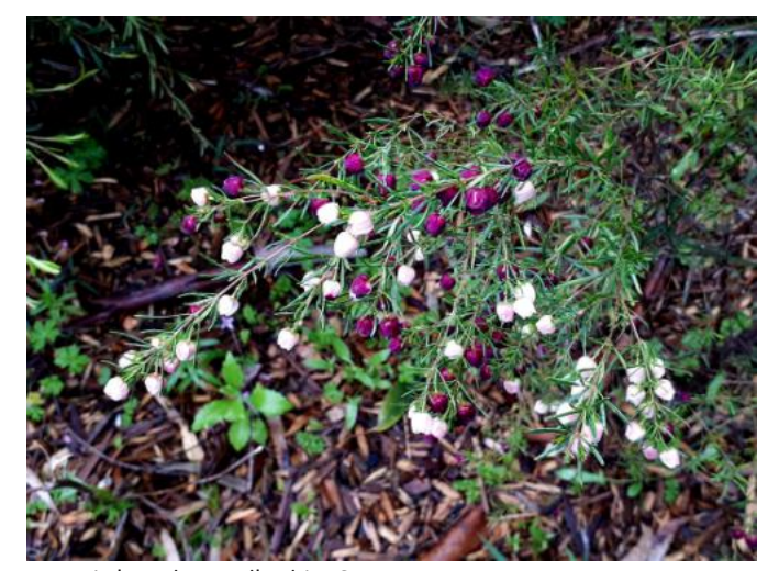
Boronia 'Purple Jared' White Sport