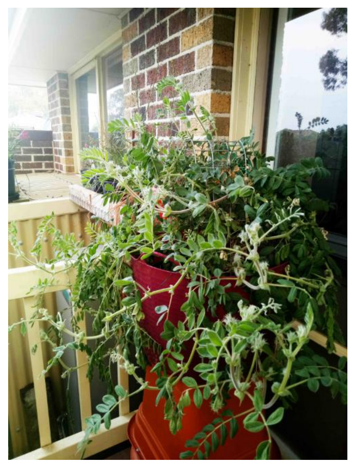
Barry Ellis had lots of buds but few flowers.

shooting from the bottom of the main stem. At this stage the shoots are looking healthy.