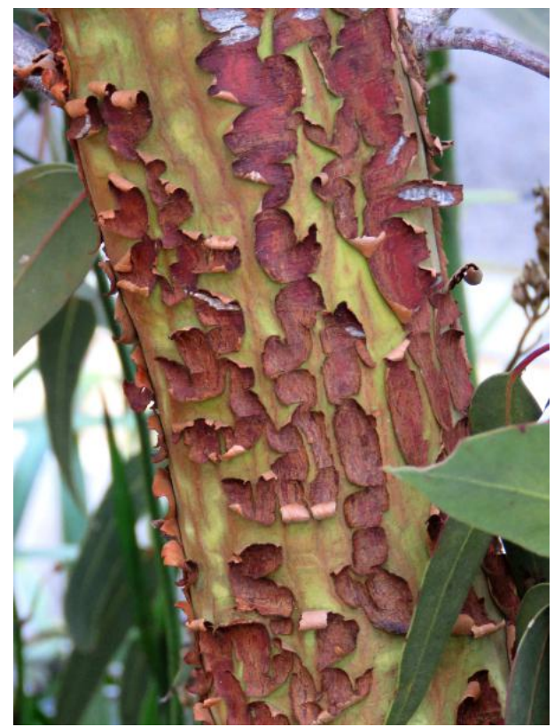
Minni ritchi bark of the trunk of Eucalyptus caesia.

I would have to say it is one of my favourite eucalypts for small gardens.