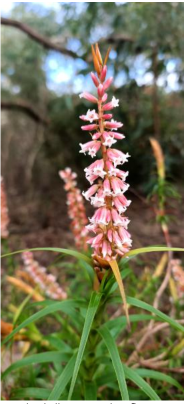
Drachyphyllum secundum flowers.