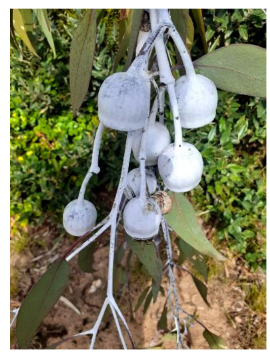
Silver-coloured gum nuts.