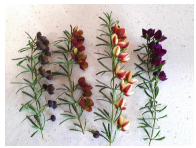
Boronia megastigma – 4 together.

yellow to the cultivar known as B. megastigma 'Lutea' which to me is almost like an albino form of the species, in that the entire plant seems to have a chloritic look about it, the foliage not the same deep green of other forms.