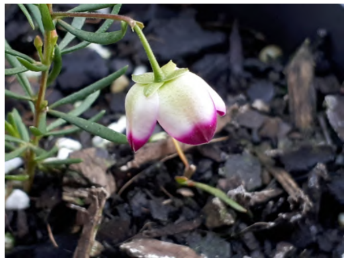
Boronia 'Purple Jared' Purple Tips

Unfortunately, although the brown form and yellow (lutea) form of the species are readily available from most nurseries, particularly when in flower, B. megastigma 'Harlequin' and B. megastigma 'Jack Maguire's Red' need to be searched for, and can usually be found in season, in small quantities, at Kuranga Nursery. I put in a few cuttings each year just as a safeguard.