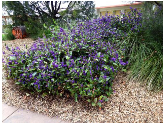
Hardenbergia violacea form in Park