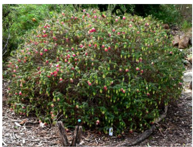
Darwinia 'Coolamon Pink'