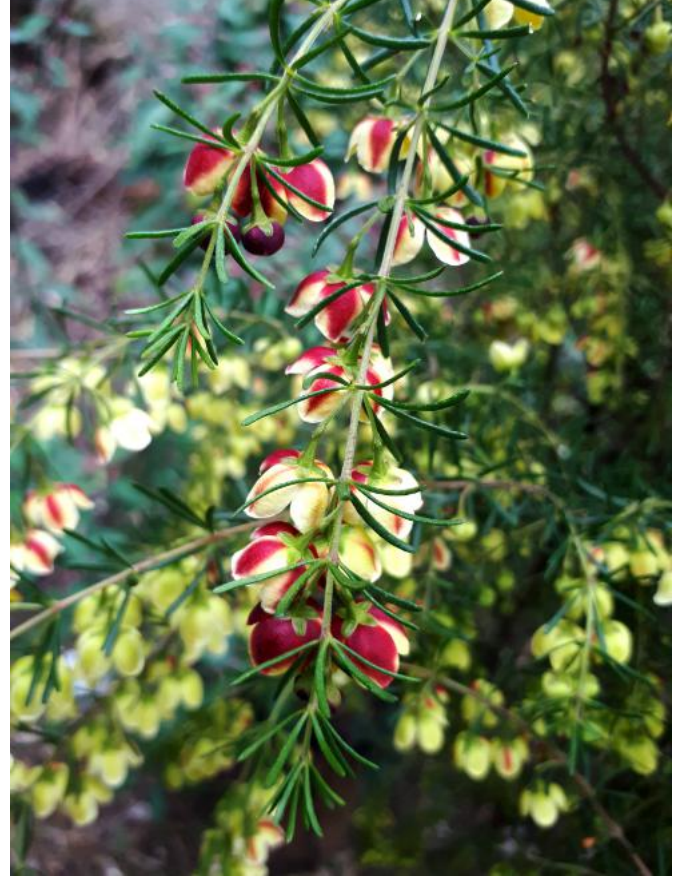
Boronia megastigma 'Harlequin'

At the best of times, many members of the boronia genus can prove a little tricky in cultivation, and in recent years a number of hybrids have been developed, which, if I may go out on a limb, have proven a little easier