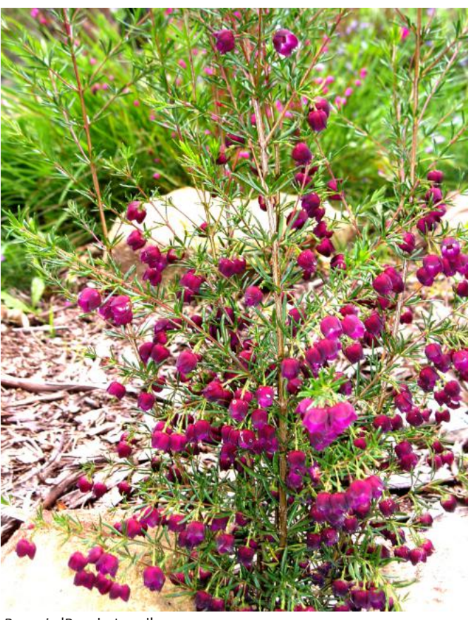
Boronia 'Purple Jared'