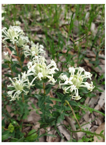
Pimelea humilis - Common Riceflower