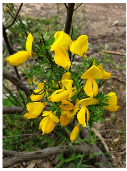
Gompholobium huegelii or possibly an introduced species?

(Ed. I have made my usual "guesses" at ID & if anyone can confirm a correct or full ID please do feel free to advise.)