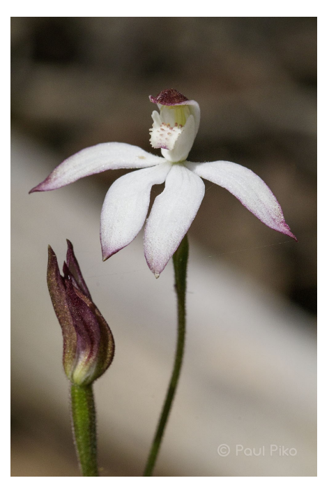
Caladenia moschata Scented Caps