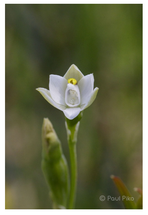
Thelymitra peniculata Trim Sun-orchid white form