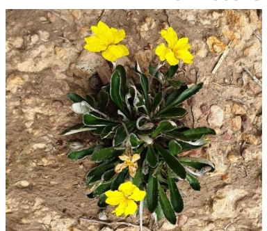
Goodenia sp. at Monument Hill

PO Box 541, Kilmore Victoria, 3764 Inc# A0054306V