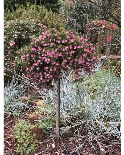
Grevillea confertifolia Grampians Grevillea Natural form (prostrate) above left, grown as a grafted standard above right.