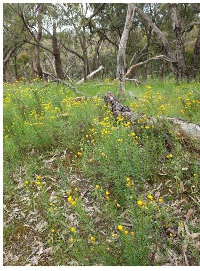
Xerochrysum viscosum - Sticky Everlasting (mass flowering)  (Continued on page 8)