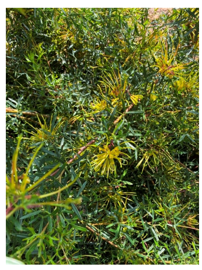
Grevillea ripicola

(More from Brian & Lorraine next issue.)