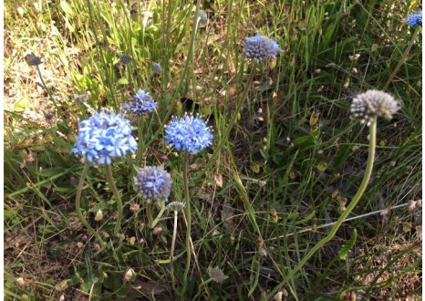
Brunonia australis - Blue Pincushion

"Wildflowers spectacular this year - especially Sun-orchids, Wahlenbergia, Brunonia, other orchids, and acres of Chocolate Lilies. And we'll have lots of fringe lilies in a little while".