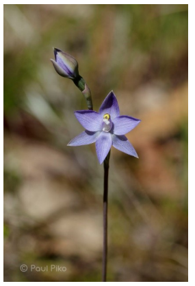
Thelymitra pauciflora Slender Sun-orchid