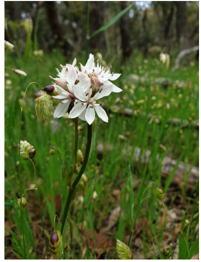
Burchardia umbellata - Milkmaids