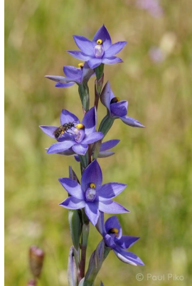
Thelymitra nuda Plain Sun-orchid