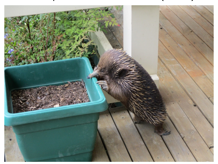
Echidna visitor