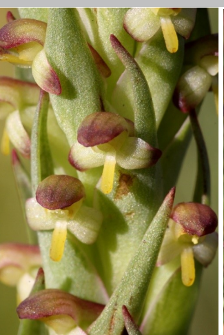
Diuris sulphurea Hornet Orchid

D. bracteata self-pollinates and can reproduce via seed or vegetatively via tubers. It can spread up to 10 kilometres per year, outcompeting native orchids, lilies and grasses.