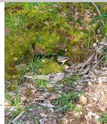
Pardalote at Monument Hill