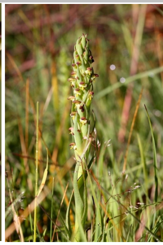
Diuris sulphurea Hornet Orchid

This weed occurs across southern Australia and is present in the Mitchell shire. To prevent its spread it is best to first bag the plant to limit seed distribution. Then remove the plant from the ground, being careful to also remove the tubers, of which there can be up to three, measuring 20mm. It should then be incinerated.