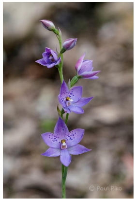
Thelymitra ixioides Spotted Sun-orchid