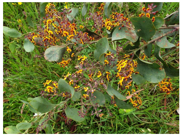
Daviesia latifolia - Hop Bitter-pea