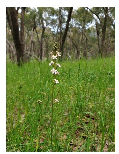
Stylidium sp. Trigger Plant Monument Hill

Until then, stay safe, well & happy in your gardens.