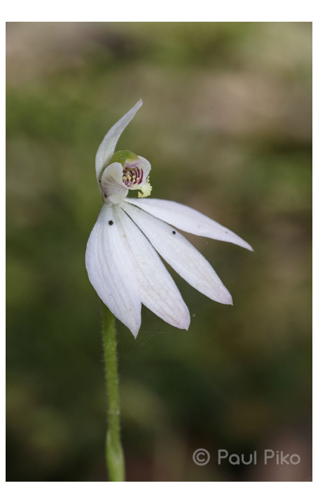
Caladenia carnea Pink Fingers