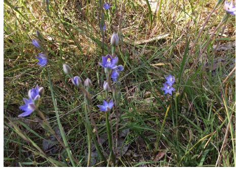
Thelymitra sp. - Sun-orchid