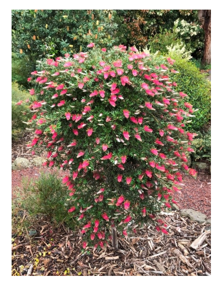
Grevillea Wakiti Gem Photo: Brian Weir