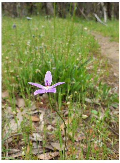
Glossodia major - Wax-lip Orchid