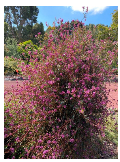
Grevillea quercifolia

Grevillea treueriana , Mt Finke in SA is where this beaut' comes from. Grows to 1m \times 1m , & is Frost tolerant to at least -3c. A prickly plant, but well worth the occasional bloody finger when weeding under or around.