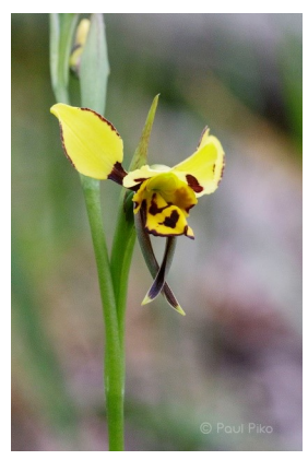
Diuris sulphurea Hornet Orchid