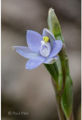
Thelymitra peniculata Trim Sun-orchid