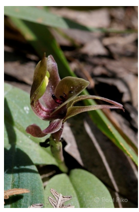
Chiloglottis valida Common Bird Orchid