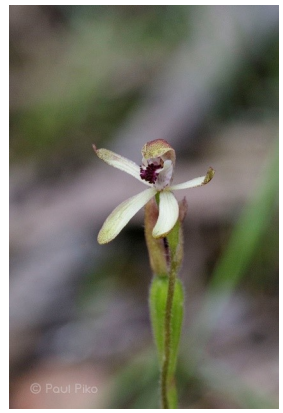
Caladenia transitoria Little Bronze Caps