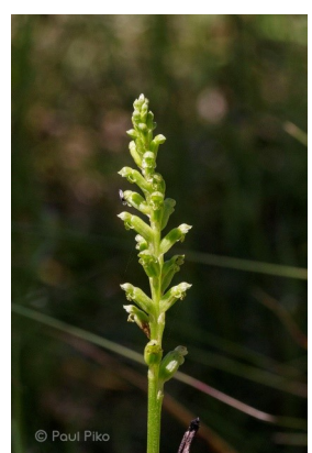
Microtis unifolia Common Onion-orchid