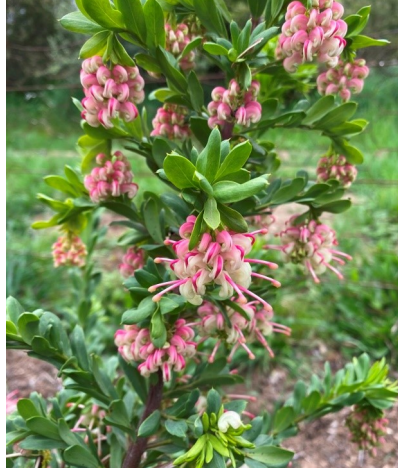
Grevillea iaspicula Wee Jasper Grevillea. (Continued on page 5)