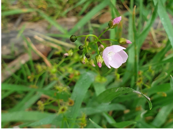
Drosera sp. - Sundew