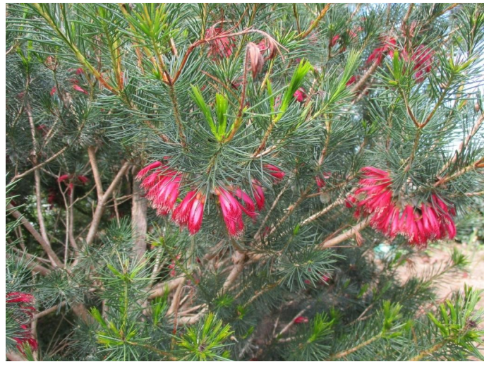
Calothamnus quadrifidus One-sided Bottlebrush