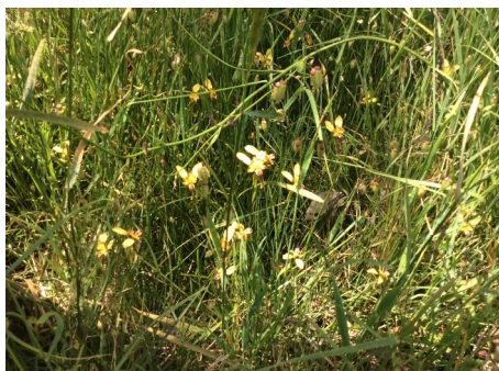
Diuris sp.