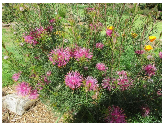
Isopogon formosus - Rose Coneflower