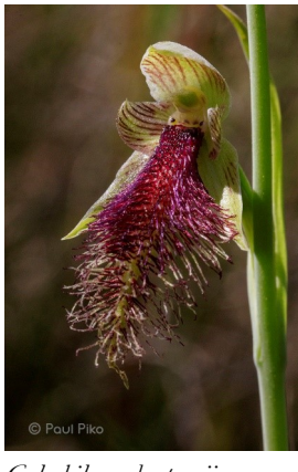
Calochilus robertsonii Purple Beard Orchid