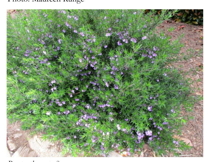
Prostanthera sp. ?