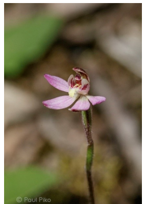
Caladenia pusila Tiny Fingers