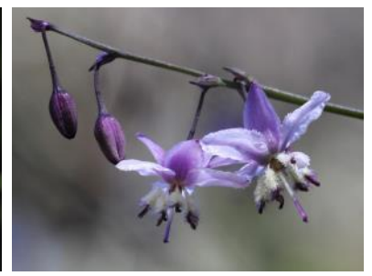
Arthropodium milleflorum Pale Vanilla Lily