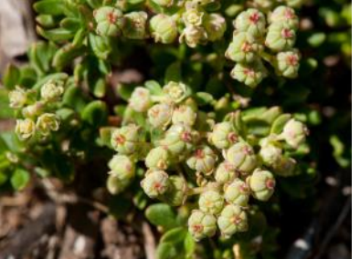
Poranthera oreophila Alpine Poranthera