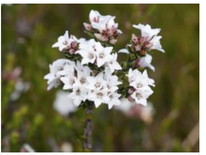
Epacris glacialis Reddish Bog-Heath