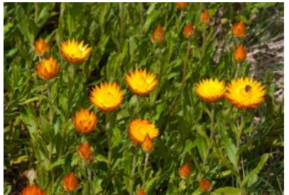
Xerochrysum subundulatum