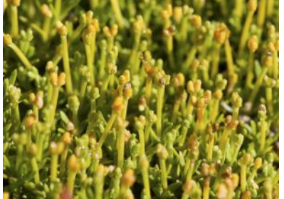
Scleranthus biflorus Close up