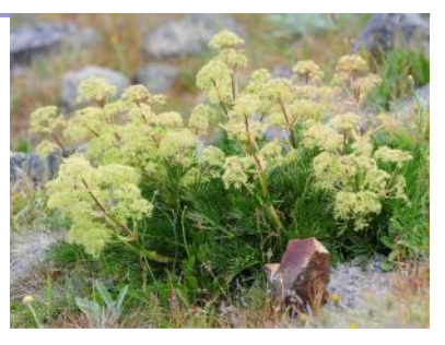
Aciphylla glacialis - Mountain Celery