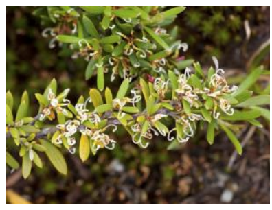
Grevillea australis Alpine Grevillea