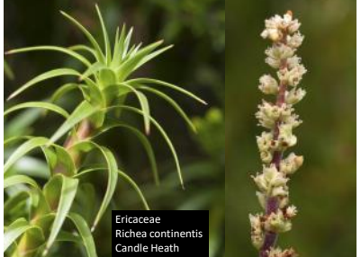
Richea continentis Candle Heath