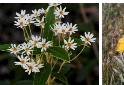
Podolepis laciniata