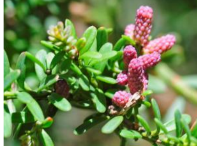
Podocarpus lawrencei Mountain Plumpine (Continued on page 10)