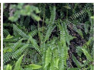
Blechnum penna-marina subsp. alpina