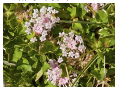
Trachymene humilis Alpine Trachymene