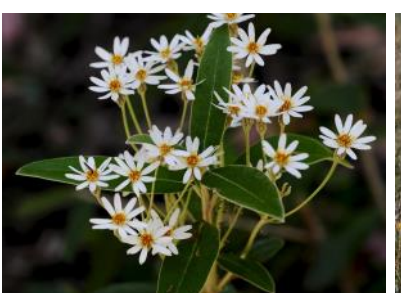
Olearia megalophylla Large-leaf Daisy Bush