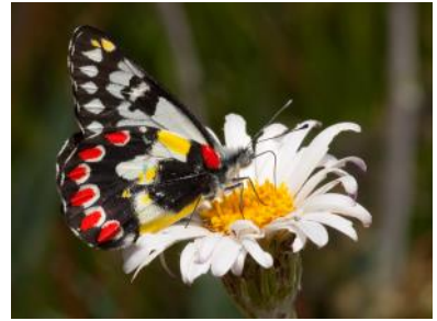
Delias aganippe Wood White on Celmisia sp.