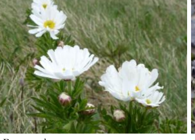
Euphrasia collina