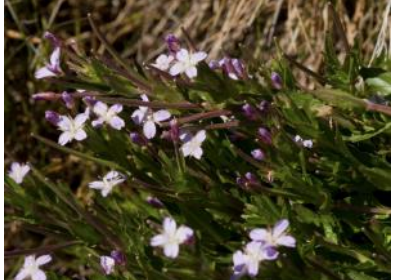
Epilobium billardiereanum Willow herb

Ranunculus victoriensis found mainly on Bogong High Plains.