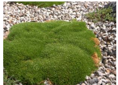
Scleranthus biflorus Cushion Bush