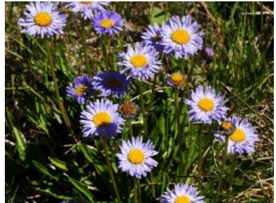
Brachyscome scapigera Tufted Daisy