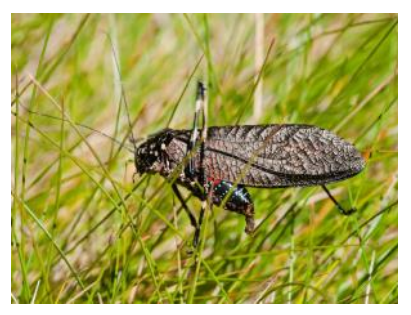
Acripeza reticulata Mountain Katydid