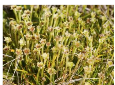
Colobanthus affinis Alpine Colobanthus

Pultenaea muelleri Mueller's Bush-pea is a vellow flowered shrub endemic to Mt Baw Baw that grows