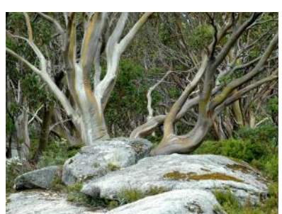
Eucalyptus pauciflora subsp. pauciflora