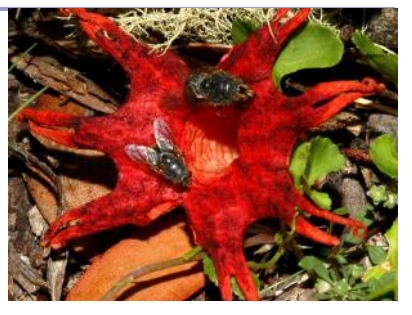
Aseroe rubra Anemone Stinkhorn fungus