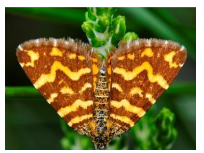
Chrysolarentia chrysocyma Small Radiating Carpet Moth