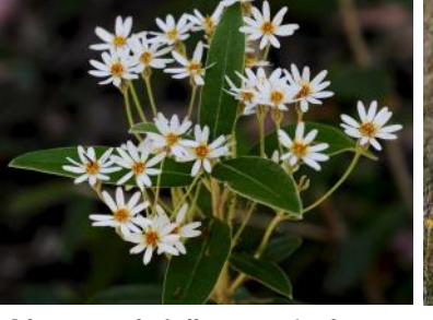
Ozothamnus alpinis Alpine Everlasting