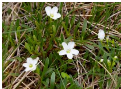
Montia australasica White Purslane