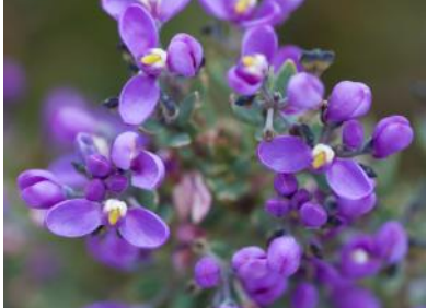
Comesperma retusum Mountain Milkwort (Continued on page 9)