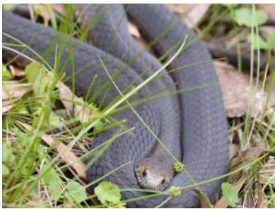
Austrelaps ramsayi Highland Copperhead