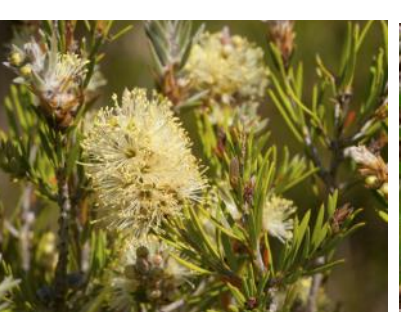
Callistemon pityoides Alpine Bottlebrush