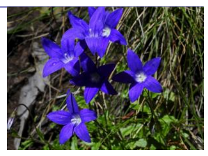
Wahlenbergia gloriosa Royal Bluebell