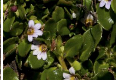
Scaevola hookeri Creeping fan-flower