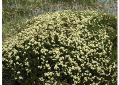
Kunzea muelleri Yellow Kunzea (Continued on page 8)