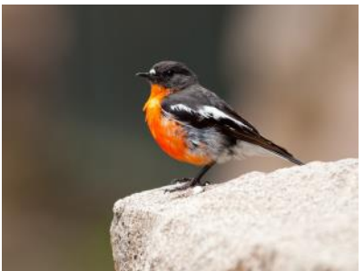
Flame Robbin