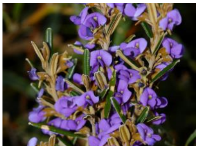
Hovea montana Mountain Hovea