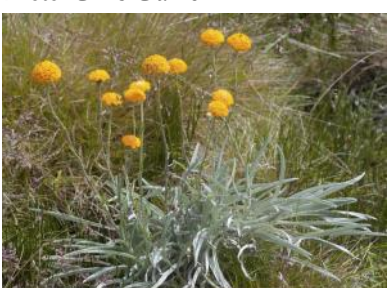
Craspedia maxgrayi