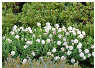
Pimelea ligustrina subsp. ciliata (foreground) and Tasmannia xerophila (background)