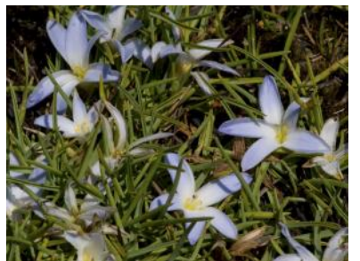
Herpolirion novae-zelandiae Sky Lily

Craspedia have composite flowers with no floral bracts and there are 13 species found across Victoria: