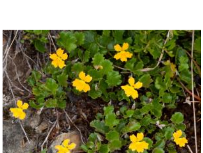
Goodenia hederacea Ivy-leaf goodenia

Kunzea muelleri Yellow Kunzea (Myrtaceae) grows on rocky peaks in seemingly endless swathes.