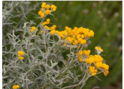
Chrysocephalum semipapposum subsp. lineare