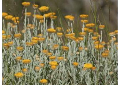
Coronidium monticola - Button Daisy