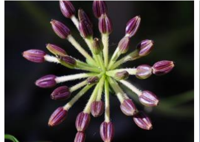
Oreomyrrhis eriopoda Australian Caraway