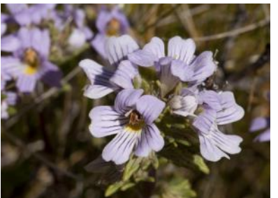
Euphrasia eichleri Bogong Eyebright