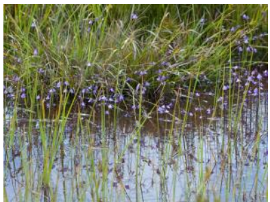
Utricularia dichotoma Fairies Aprons