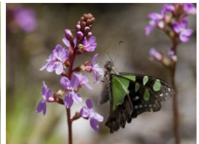
Stylidium armeria subsp. armeria & Macleay's Swallowtail