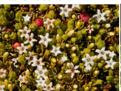
Pentachondra pumila Carpet heath