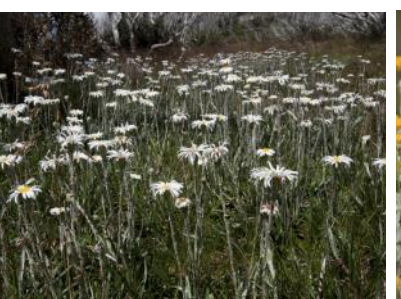
Celmisia sp. Snow Daisies