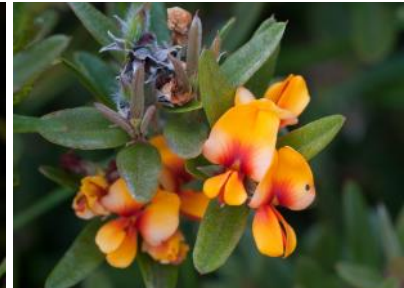
Podolobium alpestre Alpine Shaggy-Photo: Chris Clarke (Continued on page 7) pea