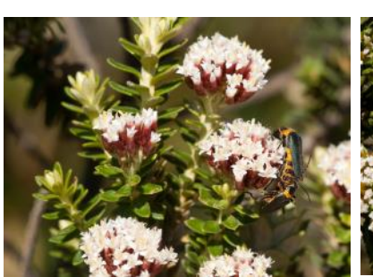
Ozothamnus cupressoides Kerosene