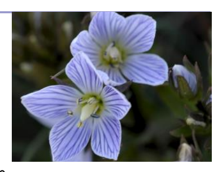
Gentianella muelleriana subsp. willisiana