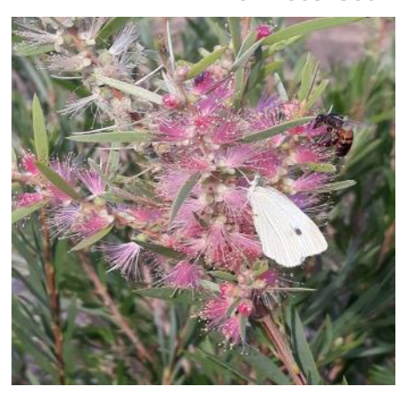
<u>Callistemon 'Injune'</u> 13.02.22

PO Box 541, Kilmore Victoria, 3764 Inc# A0054306V