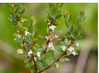
Pimelea axiflora subsp. alpina