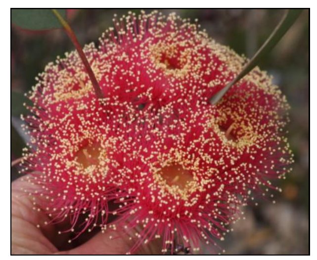
Australian Plants Society - Warrnambool & District Group July 2018 Newsletter