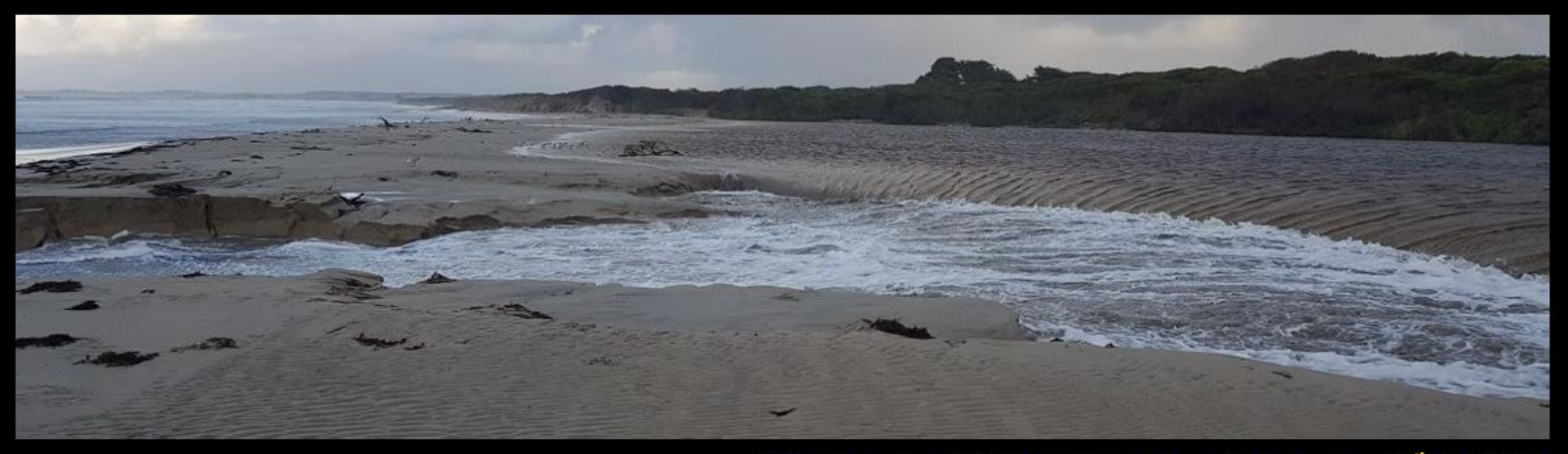
Natural opening of the Surry River estuary @ Narrawong, 17<sup>th</sup> June 2018