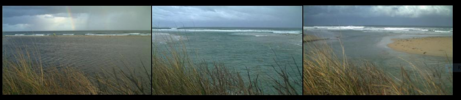
Fitzroy River estuary; three day opening sequence, June 2018