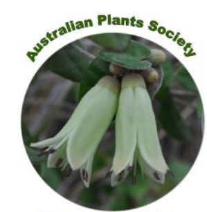
Warrnambool & District