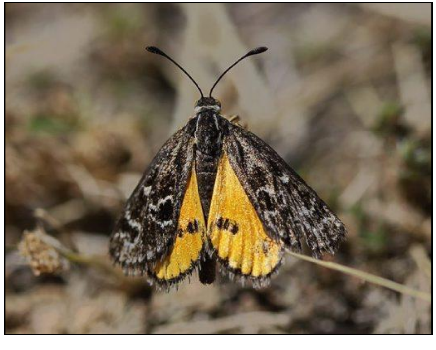
Photo: Golden Sun Moth, Synemon plana

The females rarely fly, males can be seen flying in a zig-zag pattern in the warmest part of the day looking for the females