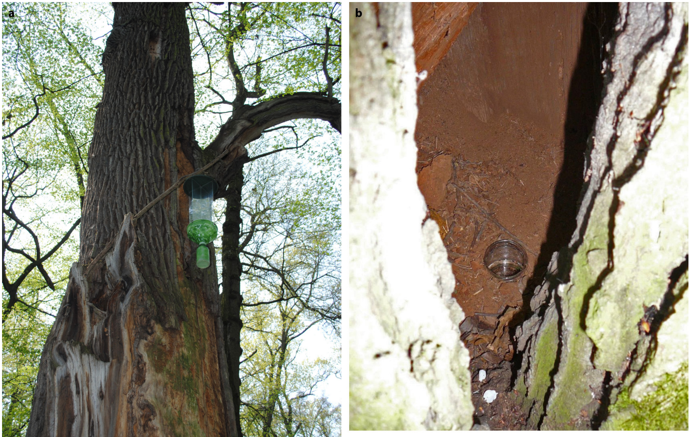
Fig. 2: Sampling methods used during the current study. a. Flight interception trap (FIT); b. Pitfall trap (PT) inside a tree hollow

identified only to family level (Tab. 1). Pitfall traps placed in tree hollows yielded 157 specimens belonging to 20 taxa and 11 families (Fig. 4a). The most abundant species trapped in the tree hollows were Tegenaria ferruginea (Panzer, 1804) and Midia midas (Simon, 1884). The most species-rich family in the pitfall traps was Linyphiidae with six species and a group of species identified only to family level. Most spiders collected in hollows are horizontal web builders. Seven spider taxa were obtained exclusively by pitfall traps. A total of