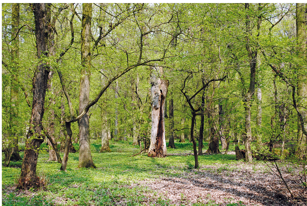
Fig. 1: Closed-canopy forest with interspersed old oaks at the Pohansko study site

A total of 322 specimens representing 47 taxa from 15 families were identified (Tab. 1). FITs yielded 165 specimens belonging to 40 taxa and 14 families. None of the species captured by the FITs were particularly abundant, only some species were present in relatively high numbers: Parasteatoda lunata (Clerck, 1757) (9 specimens), Anyphaena accentuata (Walckenaer, 1802) (8), Porrhomma oblitum (O. P.-Cambridge, 1871) (8), Leptorchestes berlinensis (C. L. Koch, 1846) (8) and Platnickina tincta (Walckenaer, 1802) (8) (Tab. 1). FITs exclusively yielded 27 spider taxa. Most species captured by FITs were Linyphiidae with nine species and a group of species