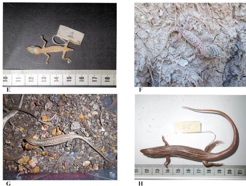
PLATE 3. Hemidactylus turcicus (E), Hemidactylus persicus (F), Trachylepis aurata septemtaeniata (G) and Trachylepis vittata (H).