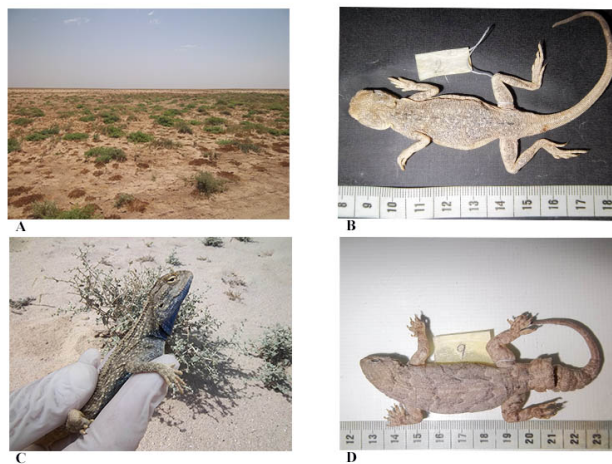
PLATE 2. Bahr AL-Najaf habitat in AL-Najaf Province Southern Iraq (A), Phrynocephalus maculatus maculatus (B), Trapelus ruderatus ruderatus (C) and Hemidactylus flaviviridis (D).