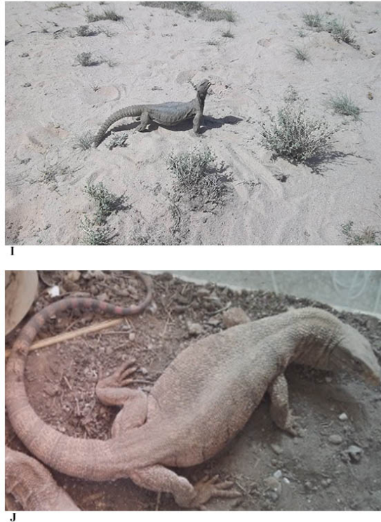
PLATE 4. Uromastix aegyptius (I) and Varanus griseus griseus (J)