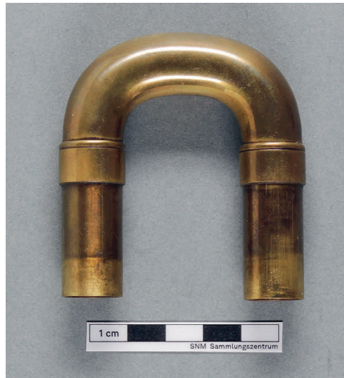
FIGURES 3 AND 4 The tuba français à 6 pistons, made before 1920 by J. Gras in Paris; and its valve slide of the first valve