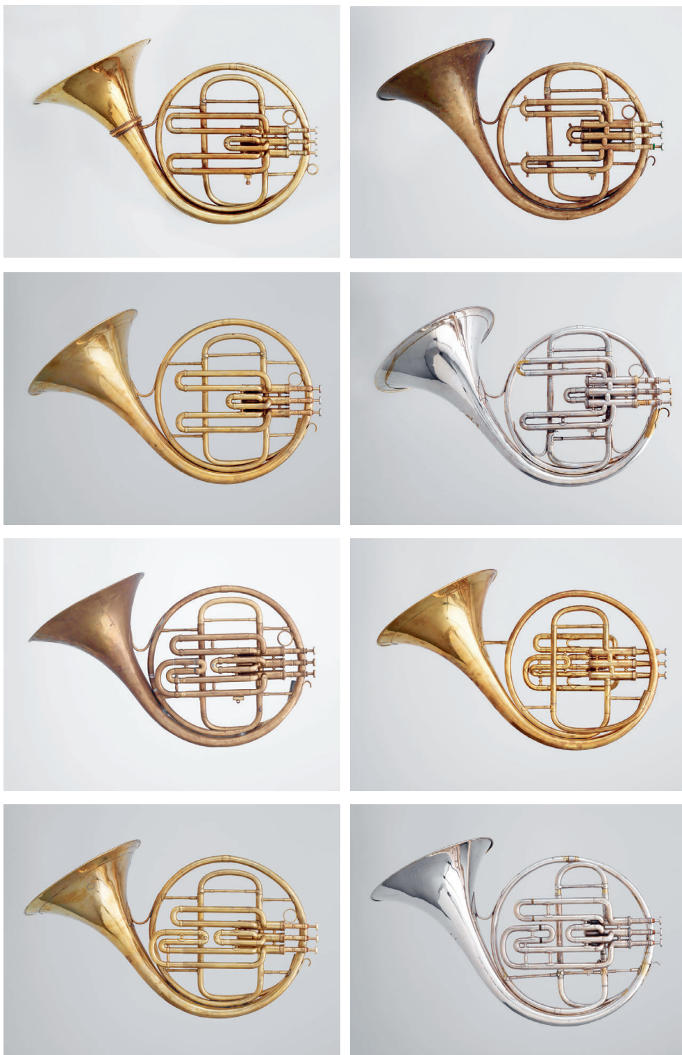
FIGURE 1 The 16 instruments involved in the long-term study: 8 horns, 5 trumpets, 1 Wagner tuba, 1 trombone, 1 tuba