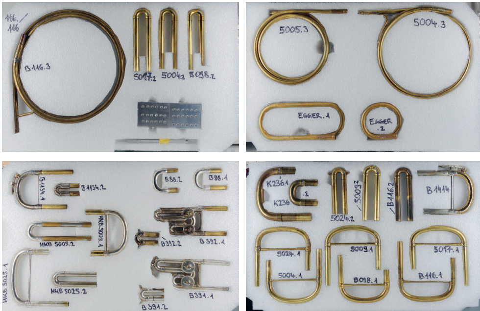
FIGURE 2 The 34 parts of the 16 instruments examined in detail before, at the project's mid-point, and at the end of the long-term study