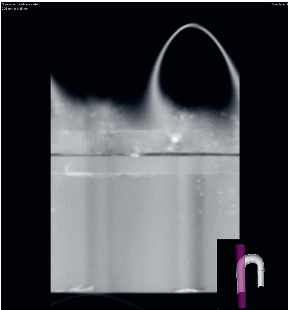
FIGURE 6 Neutron tomography, made at the end of the long-term study, of one tube of the same valve slide