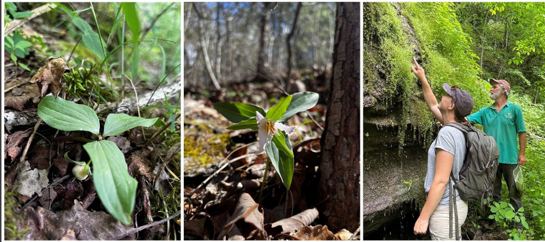
Above, left to right: Snow trillium ( Trillium nivale ) in fruit, Ozark least trillium ( Trillium pusillum var. ozarkanum ) in bloom, collecting team in the Kentucky River Palisades.

The Arboretum, State Botanical Garden of Kentucky, recently started a partnership with the Office of Kentucky Nature Preserves and the UK Department of