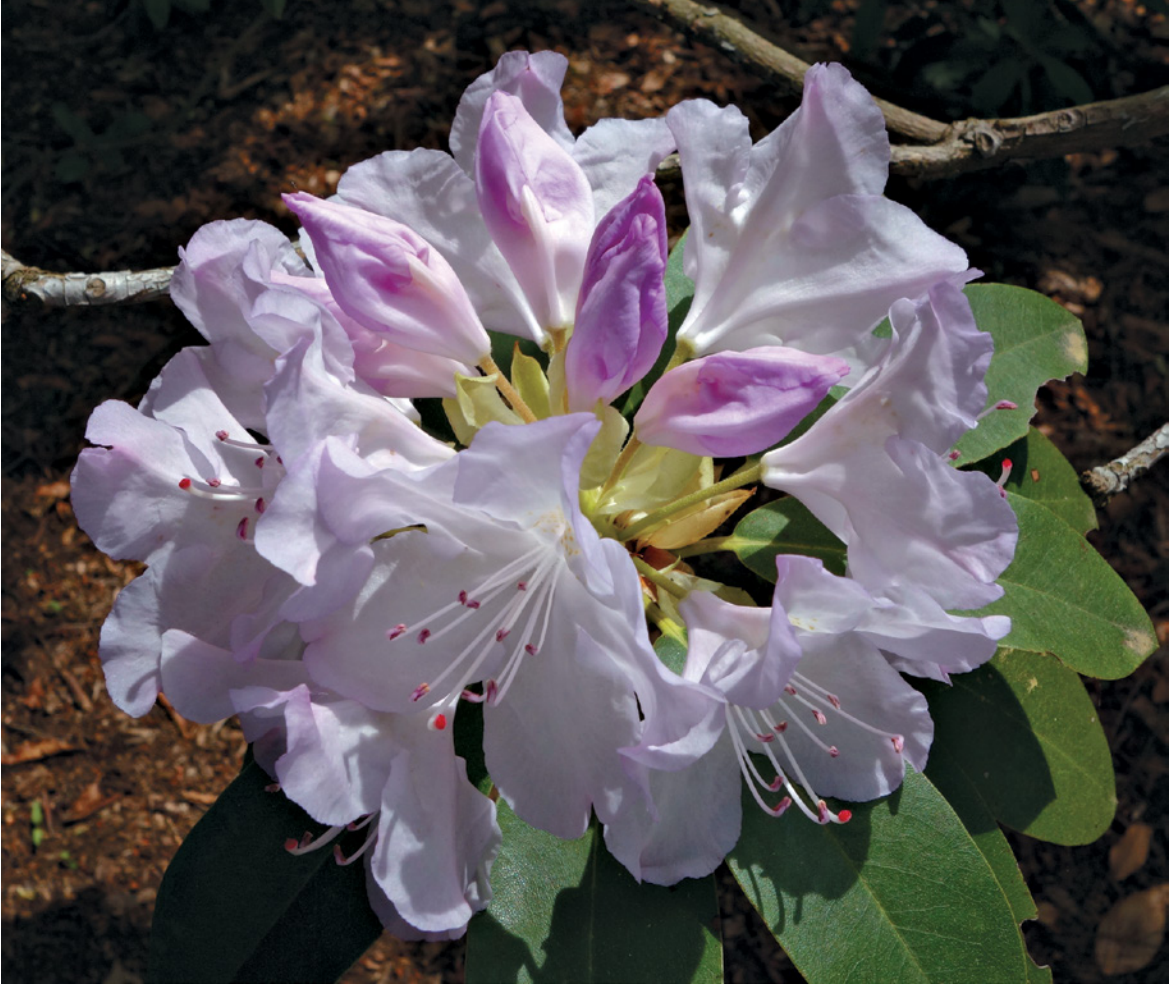
As a common name, "rhododendron" usually refers to large evergreen shrubs whose flowers have ten stamens, such as this elepidote cultivar 'Album Grandiflorum' (accession 22810-A) growing in the Arnold Arboretum's Rhododendron Dell.

and many shades in between, providing tremendous spring and summer interest in the garden. Quickly recognized for their horticultural merit, North American deciduous azaleas piqued the interest of plant collectors upon their discovery and continue to be widely lauded by gardeners today. This has led to a proliferation of cultivars and interspecific hybrids that provide a beautiful floral display every year both in gardens and in the wild (Azalea Society of America 2016).