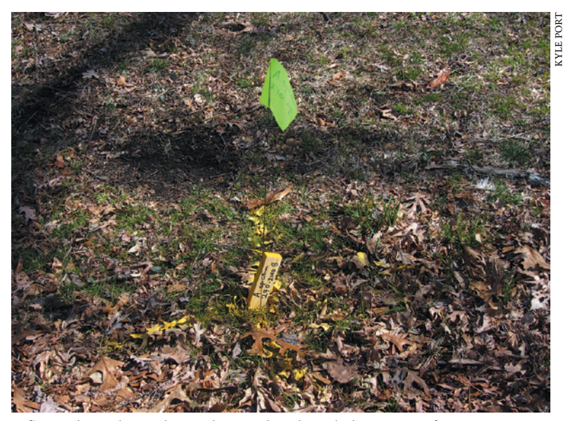
A flag and wooden stake mark a newly selected planting site for a mountain maple ( Acer spicatum , accession 270-2010-B) grown from seeds collected by Arboretum staff in New York's Adirondack Mountains.

The planting locations of the qualifiers (individual plants assigned identification letters A, B, C, etc.) of accession 637-2010, a Yunnan red-