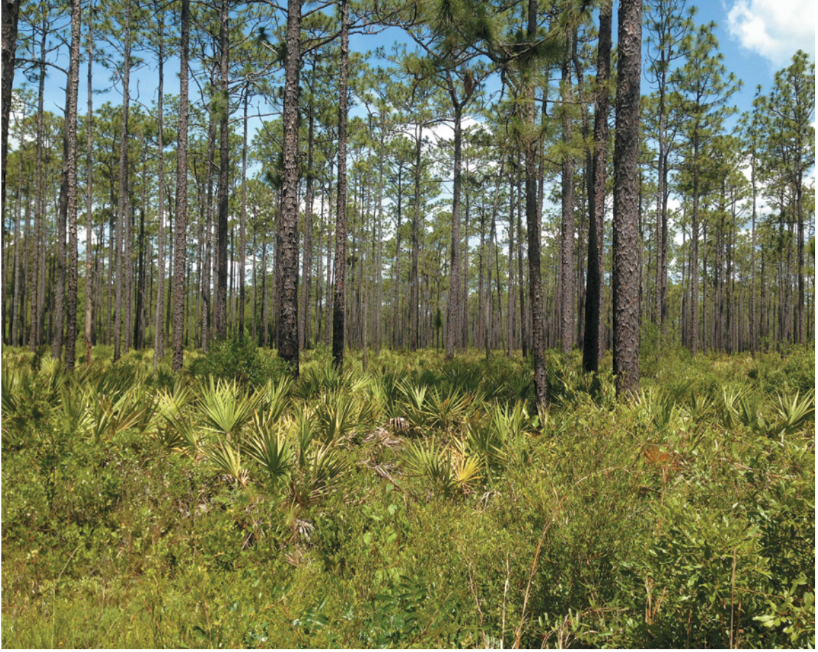
Open longleaf pine ( Pinus palustris ) forest is a typical habitat for Rhododendron viscosum subpopulations in the Apalachicola National Forest near Tallahassee, Florida.

considered to be adaptive. Adaptive genetic variation and associated traits are inherited by offspring; identifying such traits is an important (but time consuming) part of breeding all plants. The development of the Northern Lights Series is a prime example: it took 21 years from evaluating initial parents, making crosses, and field testing the seedlings before a reliably cold hardy cultivar was introduced. This is largely due to the biological constraints of breeding woody perennial species, including long juvenile periods (time prior to sexual maturity of the plant) that slow the breeding process. This also complicates efforts to understand the genetics behind important traits, further hindering the discovery of potentially adaptive genetic varia-