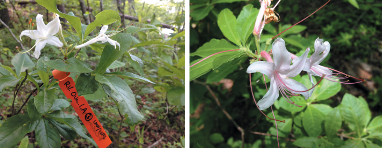
Swamp azalea ( Rhododendron viscosum ) has a very wide native range and variable growth habit. Flowers are typically white, as seen on this tagged plant (left) growing near the Fourche la Fave River in the Ouachita National Forest near Y City, Arkansas, but pink flowers also occur, as on this plant (right) found in another population within the Ouachita National Forest, this one near Eagleton, Arkansas