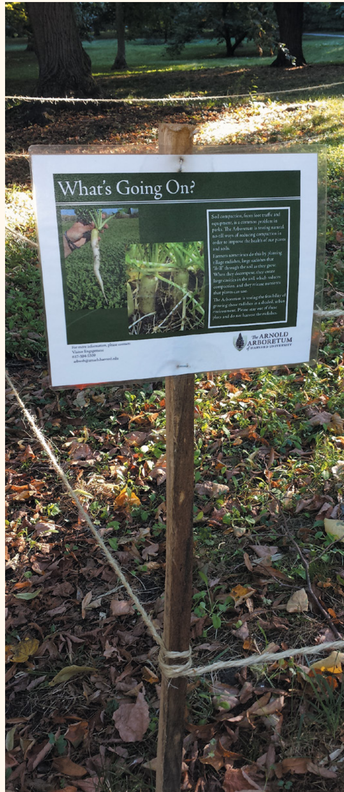
This tillage radish testing plot is in the Linden (Tilia) Collection.

Managing the health of our soils to provide the best growing conditions for the over 2,000 diverse taxa that we cultivate from temperate biomes across the world is an essential component to the Arboretum's Plant Health Care program. We hope that our adaptive management approaches will help us develop wellinformed ways to steward the next nearly 400 taxa to join our Living Collections and improve the habitats of our current collections, as well.