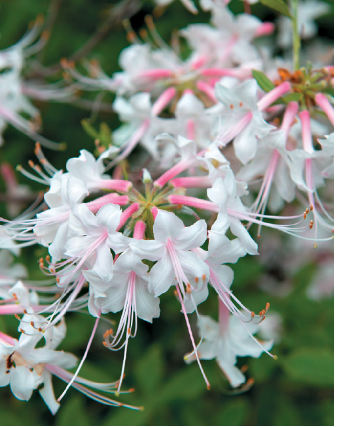
Azaleas typically have five stamens that are often strongly exserted, as seen on this Alabama azalea ( Rhododendron alabamense , 137-2005-E).

Kingdom ...... Plantae Order.....Ericales Family.....Ericaceae Genus ...... Rhododendron Subgenus..... Hymenanthes Section ..... Pentanthera