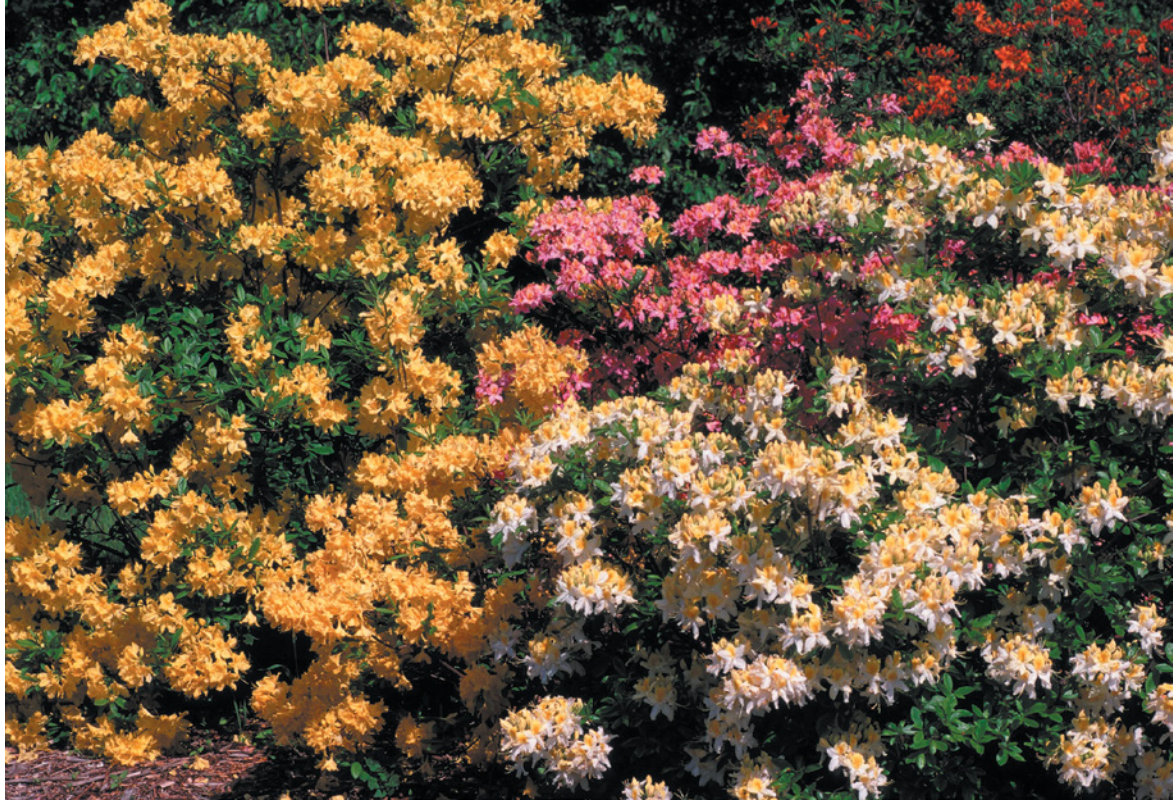
An azalea breeding trial bed at the University of Minnesota Horticultural Research Center includes introduced cultivars 'Lemon Lights' (left) and 'Northern Hi-Lights' (foreground) as well as numbered selections.