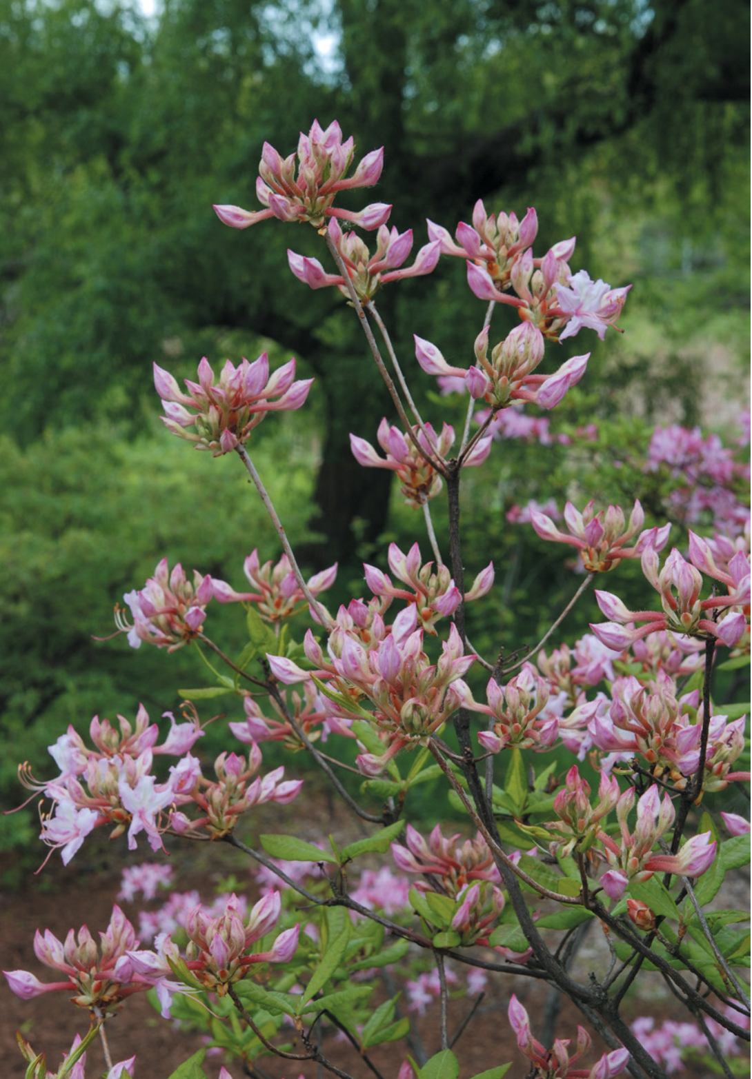
The flowers of Rhododendron periclymenoides (pinxterbloom azalea; accession 3237-C) range from white to pink to purplish pink. It grows in mesic forests and wetlands from New Hampshire and Vermont to Alabama.