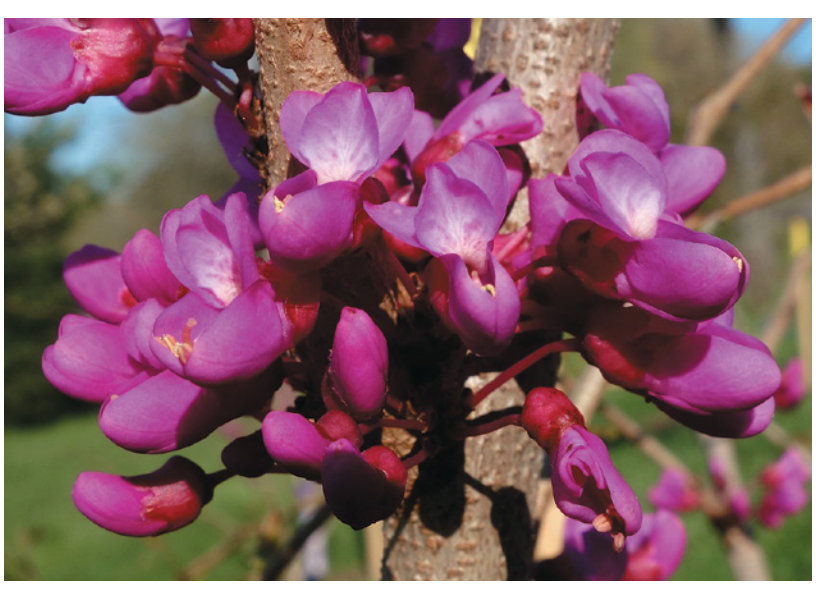
Flowers of a Yunnan redbud specimen ( Cercis glabra , 637-2010-D) that was planted in the Weld Hill Research building landscape.

as the timing is right. In preparation, planting lists and locations are reviewed, and a final walk-through of the nurseries is performed to document and adjust plans based on damage that may have occurred to plants over the winter. For example, following the record breaking snowfall-110.6 inches (280.9 centimeters) measured at Boston's Logan Airport-during the winter of 2014-2015, significant damage in the nurseries occurred as the snow melted and refroze during the spring thaw. Many young trees with low branches were pulled apart with the shifting snow and ice that covered them. Evaluations completed the (continues on page 12)