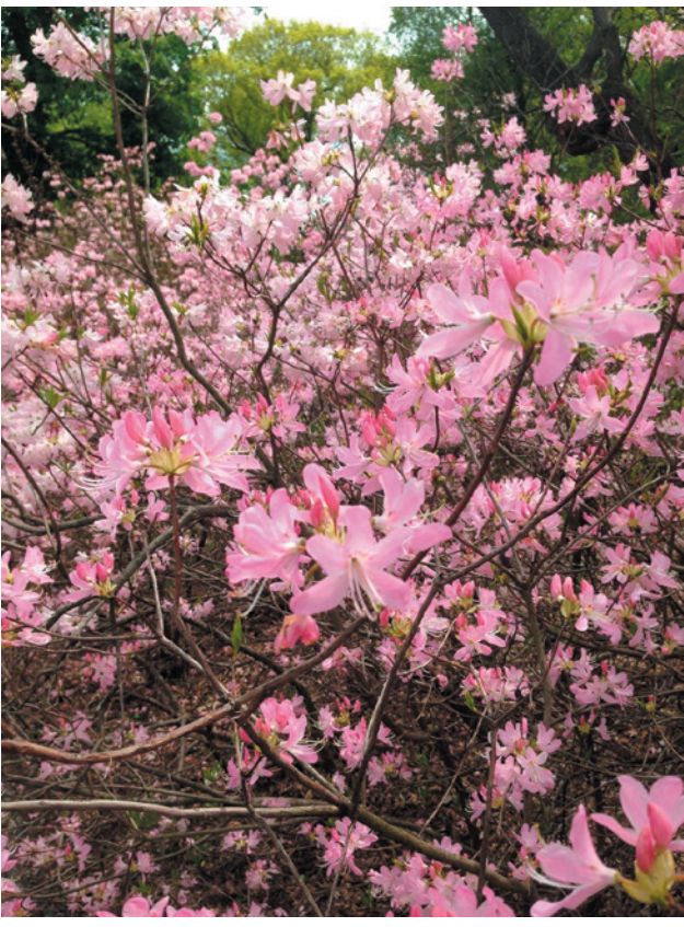
Rhododendron vaseyi (pinkshell azalea; accession 657-70) is rare in the wild, with only a few known populations, all in North Carolina. The Arnold Arboretum has a number of conservation accessions of this beautiful pink-flowered azalea.

Arboretum is currently being used to test these landscape genomic approaches by obtaining environmental data from the origin points of the accessions and performing genetic sequencing on those accessions. The goal is to identify potentially adaptive DNA variation in North American deciduous azaleas that could benefit future breeding efforts by identifying promising species or populations as parents for future cultivar development. For example, patterns of genetic variation might be detected when looking at a set of individual azaleas originating from environments with varying degrees of average winter minimum temperatures. If an association is detected between patterns in the genetic variation and average winter minimum temperature, it is possible that the genetic variation confers an adaptive advantage in those