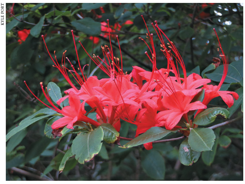
Rhododendron prunifolium (plumleaf azalea) is a late-season (July to September) bloomer, bearing flowers in shades of red and orange. The flowers of Arnold Arboretum accession 815-90-J, seen here, are an especially vibrant cherry red.