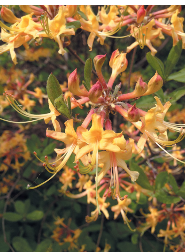
Rhododendron austrinum (orange azalea; accession 1403-85) is native primarily to the Florida panhandle and adjacent regions in Mississippi, Alabama, and Georgia. It bears fragrant yellow and orange flowers.

Collections at the Arnold Arboretum and our program's prior sampling of wild populations of swamp azalea constitute an ideal source of plants to help answer these types of research questions. Most importantly, plants in this collection are linked to detailed information about their collection locations that allow for relationships between genetic and environmental variation to be investigated. North American deciduous azalea germplasm at the Arnold