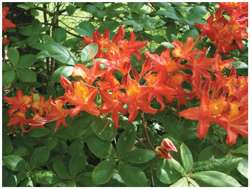
The brightly colored flowers of Ghent hybrid azalea cultivar 'Reine des Rouges' (accession 623-61-A) show a resemblance to those of flame azalea ( R. calendula-ceum ), one of the parent species originally used in hybridizing the Ghent azaleas.

The Ghent hybrid azaleas resulted from crosses between the European native azalea R. luteum (yellow azalea) and a number of North American species including R . calendulaceum (flame azalea), R. periclymenoides (pinxterbloom azalea), and R. viscosum (swamp azalea) (Dirr 1998). Initial crosses were made in Ghent, Belgium, starting around 1820, additional hybridization occurred in England, and many Ghent hybrid cultivars were introduced, primarily from Belgium, in the following decades. Although the parentage is quite mixed, these hybrids are often grouped together under the name R. \times gandavense. They are notable for their often fragrant flowers that come in a wide range of colors. The Ghent hybrids lost popularity as other hybrid azaleas were introduced, but 22 Ghent cultivars can still be seen in the Arnold Arboretum collections.