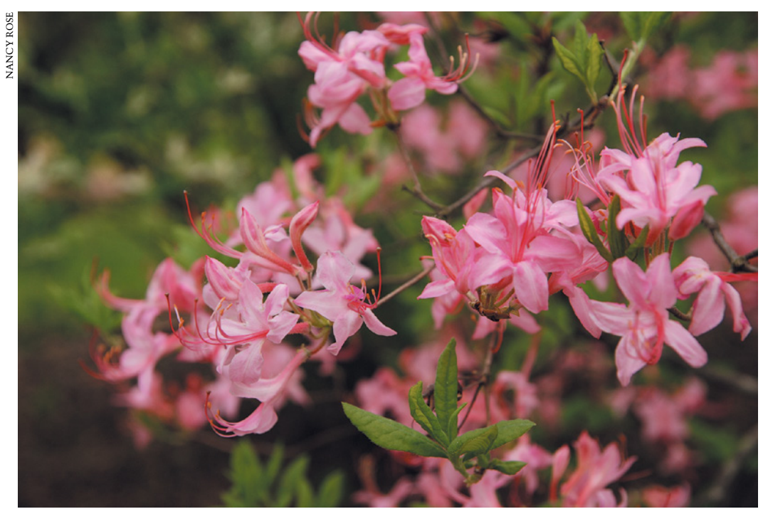
Rhododendron prinophyllum (roseshell azalea) has a wide native range from Maine to Georgia and Texas. Its flowers may be light to deep pink.