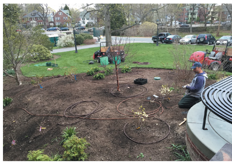
Watering is key to successful establishment of newly installed accessions. The Arboretum deploys both hand-watering and automated irrigation systems such as this one being installed in the renovated planting area in front of the Hunnewell Building by Horticulturist Greg LaPlume.