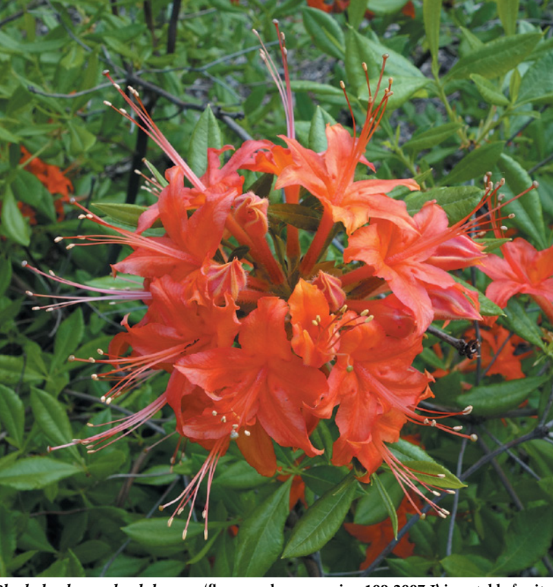
Rhododendron calendulaceum (flame azalea; accession 109-2007-J) is notable for its brightly colored flowers that range from yellow to orange to bright red. This species is native to the Appalachian Mountains ranging from New York to Georgia.