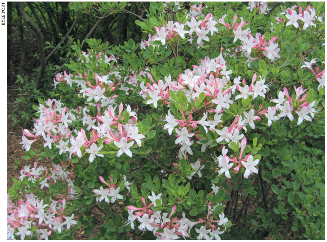
Rhododendron atlanticum (coastal or dwarf azalea; accession 108-2007-A) is native to coastal regions in the Mid-Atlantic and Southeast. Its white to light pink flowers are sweetly fragrant.