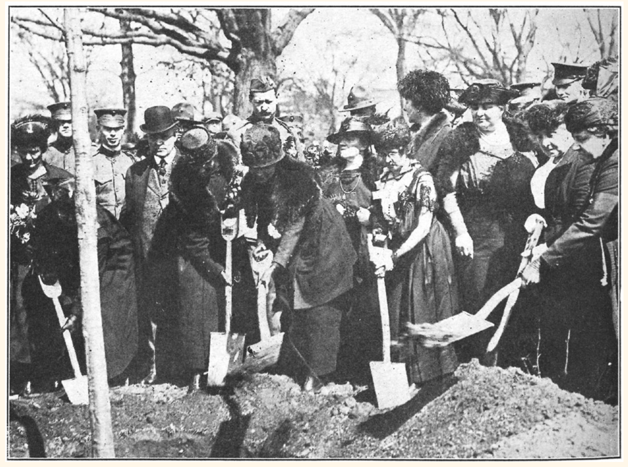
A tree planting in honor of dead marines. In memory of the gallant marines who had "gone west," mothers of the marines marked Mother's Day in New York City by planting memorial trees in honor of the sons who gave their lives to their country in World War I. The trees were placed on the mall in Central Park with impressive ceremonies.