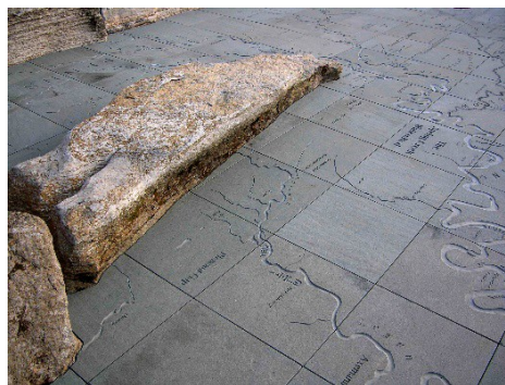
Artist: Stacy Levy

The Overlook Pavilion itself is intentionally situated on a small watershed divide. Rainfall from the Overlook Pavilion’s roof falls onto the sculpture and flows out of the gap in the boulders which represent Bald Eagle Mountain, just as water in the Spring Creek watershed flows out through a gap in Bald Eagle Mountain and into the Susquehanna watershed. Pour a bottle of water on the map at the beginning of your stop, and it may be exiting the map by the time you are ready to leave.