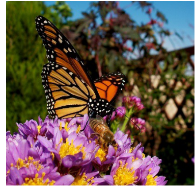
Monarch butterfly and honeybee feeding on aster flowers

Children's Garden. There are over 140 species of milkweed native to North America. The plant is named for its sticky white sap, which contains chemical compounds which deter insect herbivores. The flowers provide nectar for many insect species and the plant is a food source of Monarch butterfly caterpillars, which protect themselves from predators with toxins accumulated from their diet.