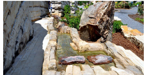
The In-and-Out Creek carves a water gap through rocky ridges in the children's garden

As the Appalachians were re-uplifted, streams which were already present on the land surface sawed through them, creating features called water gaps. The In-and-Out Creek in the children's garden, which carves a path through the rocky ridges, is an example of a water gap. Passes created by water gaps were vital to travel in the pre-automobile era, allowing travelers to bypass steep climbs over high Appalachian ridges.