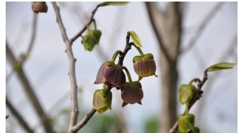
Pawpaw ( Asimina triloba ) in bloom

Edible plants are scattered throughout the garden. They include familiar crop species, like those planted in the Harvest Gardens in the children’s garden, fragrant herbs like sage and thyme in the Rose and Fragrance Garden, and also less familiar plants that are never seen in a grocery store. Edible plants in the botanic garden include: