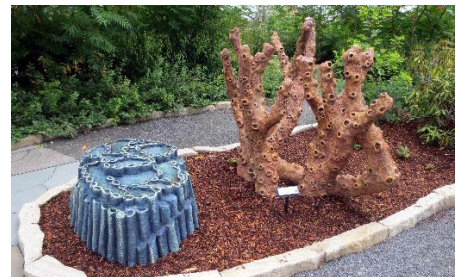
Larger-than-life fossil reconstructions in the children's garden

In the early Paleozoic, Pennsylvania was located near the equator, underneath a shallow ocean. Thick layers of limestone and sandstone accumulated on the ocean floor. The remains of marine organisms, like the corals and the nautiloid reconstructed in the children's garden, were incorporated into the rock layers as they were deposited.