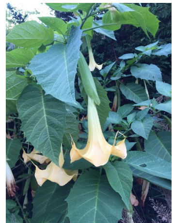
Toxic Angel’s trumpet, showing the trumpet-shaped blooms for which it is named