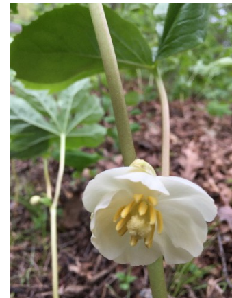
Pennsylvania native mayapple ( Podophyllum peltatum )