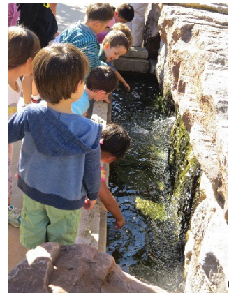
es the many springs present in our region.

Sewage was not the only pollutant to take a toll on water quality. In one notorious episode, sodium cyanide dumped down a drain on the Penn State campus killed 147,000 fish at the Benner Spring Hatchery and untold numbers of wild organisms. Leaky storage tanks of a State College chemical factory, now the Centre County Kepone Superfund site, leaked organochloride pesticide waste into the surface and ground water, resulting in portions of Spring Creek being designated as catch-and-release only due to chemical residues in the fish.