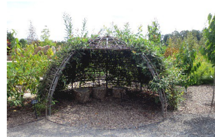
Crop-guarding hut in the Susquehannock encampment in the children's garden

By the time of European contact, the inhabitants of Pennsylvania practiced a mixture of agriculture and hunting and gathering. Central Pennsylvania was home to several different Native American tribes belonging to Iroquoian and Algonquian cultural and linguistic groups: the Susquehannock, Lenni-Lenape (or Delaware), and Shawnee.