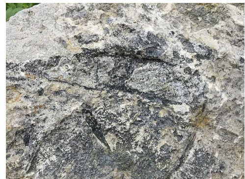
Fragment of fossil lycopod in the children's garden

Plants representative of ancient lineages can be found throughout the botanic gardens. The oldest plant in the garden, and one of the most primitive, is a fossil lycopod trunk fragment, found in the children's garden near the Time Spiral patio feature. Modern lycopods, also known as ground pines or clubmosses, are small plants which are common in Pennsylvania forests. Like ferns, they reproduce using spores rather than seeds. Tree-sized