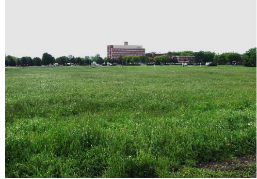
The future site of the H.O. Smith Botanic Gardens in 2002, before construction began

Land for an arboretum was first set aside by Penn State's Board of Trustees in 1914, but nearly a century passed before construction of The Arboretum at Penn State began.