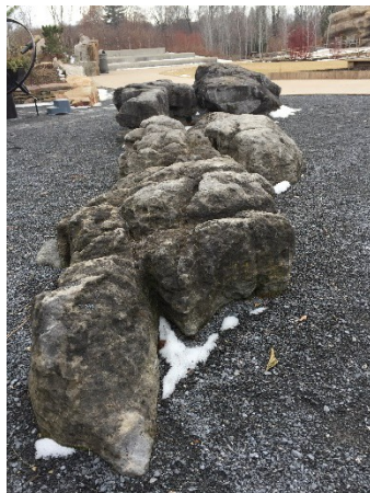
Deeply weathered limestone boulders in the children's garden depict a small-scale version of central PA's karst bedrock.

Erosion excavated the ridges and valleys and carved water gaps through the mountains, but chemical weathering also played an important role in the development of the modern landscape. The limestone underlying Nittany Valley and the Arboretum is deeply weathered by chemical processes. Natural acids from rainwater and decaying organic material percolate along fractures in the rock, dissolving carbonate minerals. If the deep soil of the valley was all removed, a "karst" topography would be revealed, with pinnacles of dissolution-resistant rock separated by deep fissures where weaker rock has dissolved away. Dissolution has created a weak and porous bedrock, permeated by many voids, caves, and sinkholes.