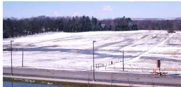
Meltwater pooling on the site of the future Marsh Meadow, prior to the beginning of Arboretum

Efforts to protect the health of the Spring Creek watershed are visible at the Arboretum. The Marsh Meadow preserves an infiltration area for water running off the Penn State campus and the College Heights neighborhood.