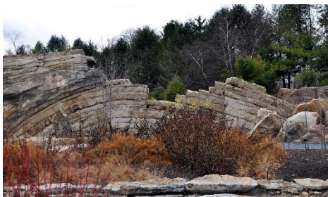
Masonry in the children's garden depicts an anticline, or arched fold

assembling them into a single supercontinent called Pangaea. During the slow-motion collision of continents, the flat-lying limestones and sandstones which had been deposited in the ocean were folded, faulted, and thrust upwards in repeated mountain-building episodes that created the early Appalachian Mountains.