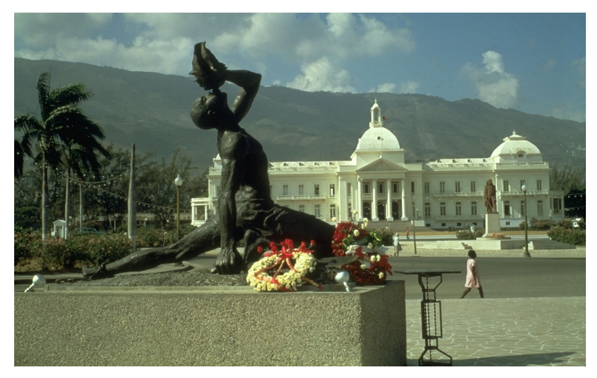
Figure 1.8 Statue to the Maroon

highly African accent, modern Kreyol, or an older Creole.<sup>32</sup> For one scene in particular, in the maroon hideout, I enlisted the help of other French speakers and of native Kreyolspeaking Haitians and was unable to get any consensus on which language or languages were being spoken in the passages in question. Perhaps few gamers would be bothered by this opacity, but my own experience suggested that, in some capacity, the game was holding me at arm's length, reminding me of my own powerlessness within the digital system. This dynamic is, of course, a part of every videogame-playing experience. It is felt whenever a player fails to advance to the next level, is killed, or "desynchronized" and must begin again. And though untranslated language appears in diverse videogames, when the content is historical slave revolt, such formal devices act as a productive partition that calls to mind the broader semiotics of slave resistance, like a lamp in a window, the monkey-wrench quilt, a song about a drinking gourd—symbols to some but not legible by all.<sup>33</sup> As such, moments like these may act like the statue to the maroon slave that stands in downtown Port-au-Prince.