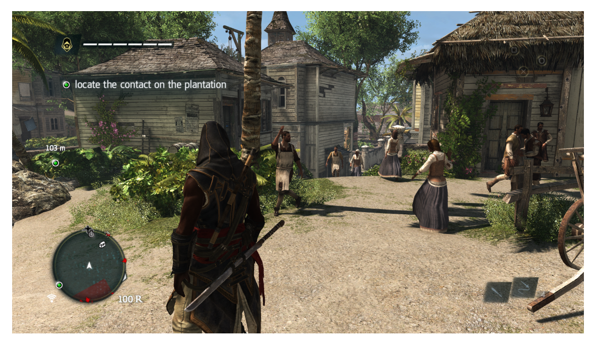
Figure 1.5 Freedom Cry

thank him in English, sometimes in French, and sometimes in Kreyol. In the cutscenes, the use of foreign languages is more spare, but with captions, one can read a translation in brackets (such as "[Bully!]"), though no transliteration of the word heard is given (in this case, "Baa John") nor any indication of what language the character has spoken (here, Trinidadian Creole), lending a kind of mystery to the game, like a door through which one is not permitted to walk. In games about slave revolt, this trademark of the franchise works to particular effect in that such linguistic doors, to stick with the metaphor, allow only certain players to pass through—in many instances in Freedom Cry , for example, the very few players who speak Haitian Kreyol.