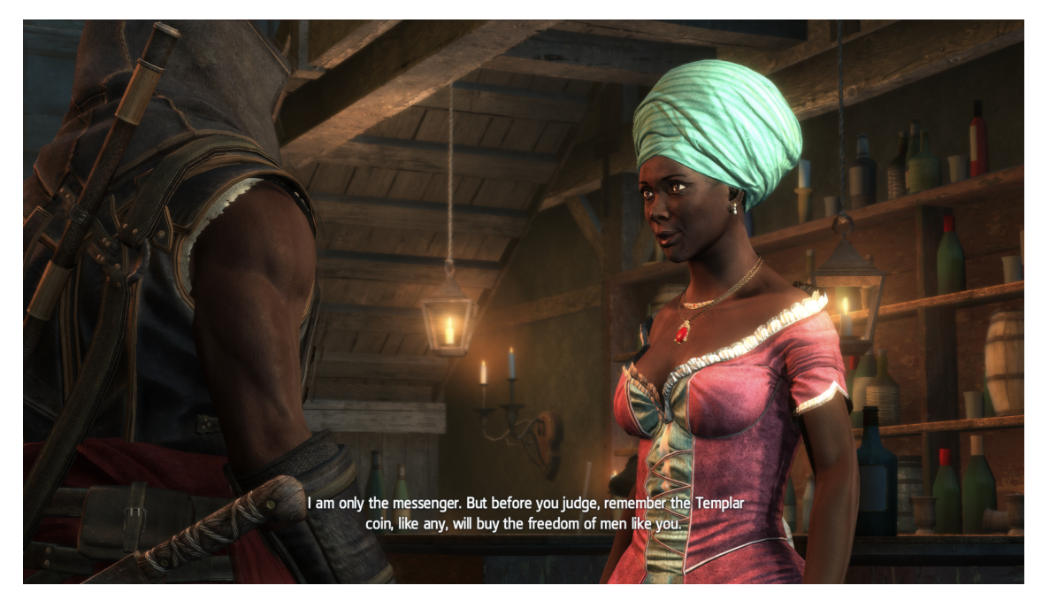
Figure 1.7 Freedom Cry

that this term implies in reference to the culture's sense of community, since it is a word freighted with history.