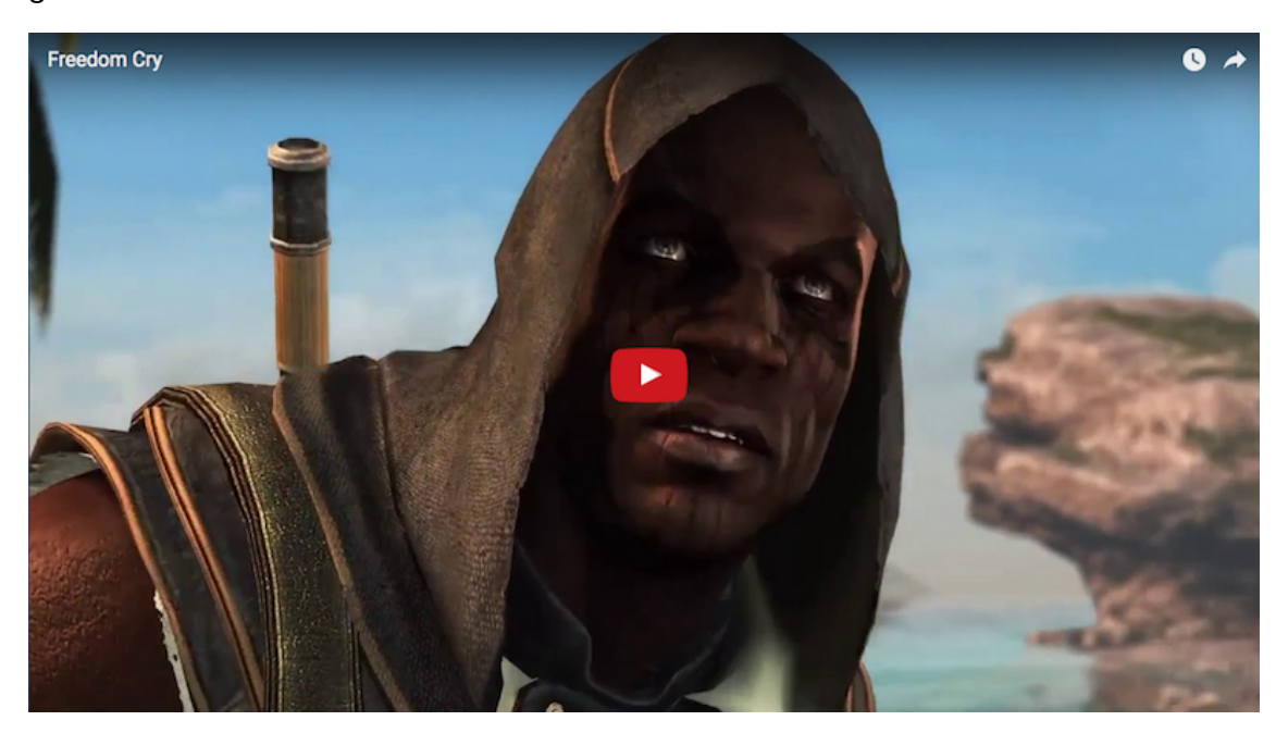
Figure 1.6 Freedom Cry (https://www.youtube.com/embed/kc-5ngfN1Ww)

those who cannot, much the way the hacker Erudito reveals certain elements only to the gamer who can catch Citizen E in Liberation.