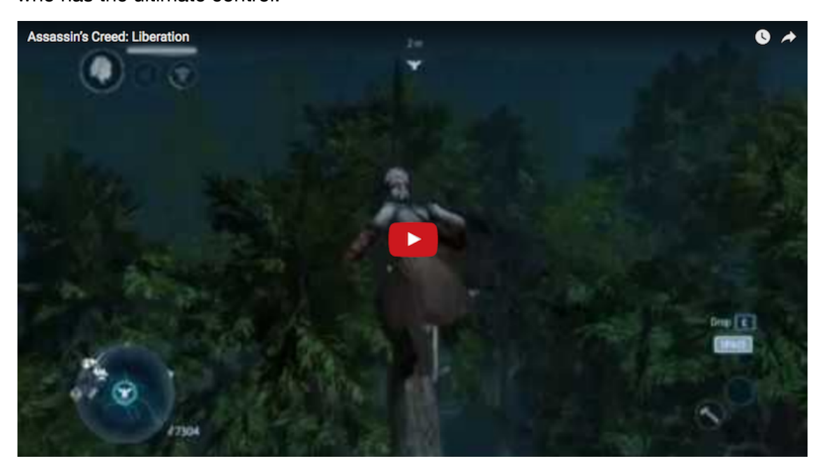
Figure 1.1 Assassin's Creed: Liberation (https://www.youtube.com/embed/yZXlevoppJY)

history of the panorama in World Exhibitions, Lieven de Cauter writes, "In the panorama the capitalist need for spatial expansion was, as it were, transferred to perception: the 'all-encompassing view' becomes an aesthetic experience of the first order. The viewer of a panorama takes enjoyment from a distant reality that can be possessed, that is always on the verge of being annexed or colonized."5 The panoramic view of colonial territory should always be thought in terms of the bodies and space that are claimed as a part of the act of viewing. But it is worth noting that these viewpoints actually operate like panoramas in reverse: rather than illustrating the space from the point of view of the character in a 360-degree rotation of his or her gaze, the "camera" swings out to show the protagonist atop his or her perch. In performing this perspective gyre, the protagonist is diminished in comparison to the space around - she or he becomes a part of the space to be claimed, and by aligning the gamer's perspective with a disembodied, imaginary camera, the viewer is reminded that it is the game designer, and not the gamer, who has the ultimate control.