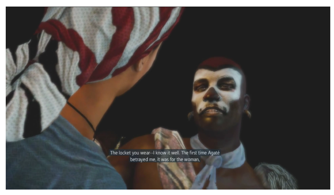
Figure 1.3 Assassin's Creed: Liberation

the playable character seem inhabited by the player him- or herself, a device that here parallels the slave's appropriation by the master.