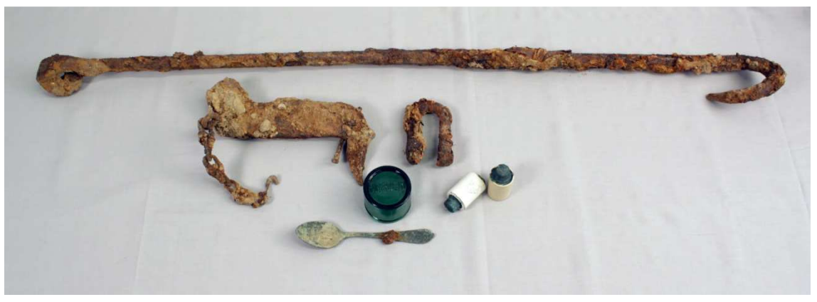
Fig. 6 – The set of finds found from the pit together with the bones included one tea spoon, two fuses, a glass jar and three metallic objects.

Besides the bones, the pit contained a few finds, which date the burial to the early 20<sup>th</sup> century. The set contained an iron bar, shackle, iron fastener with a piece of chain, two fuses, tea spoon and glass jar for shoe polish called Nigrolin. (Fig. 6) Furthermore, there were fragments of fabric made of hemp and pieces of a corset with remains of yellow and red paint (REPO 2016: 61). (Fig. 7) One needs to confess that without the bones the pit would have been quite easily interpreted as a modern waste pit without further documentation. Although the pit was beyond our time scale of the investigations of the village, it was an intriguing find and brought along many questions: Where did the snake came from? Why these two animals were buried together on the market square of Lahti and when? Why only the skull and fragments of the other hind limp of the horse were buried? Why was the skull of the snake missing? Why on earth these bones were in the same pit with this strange collection of finds?