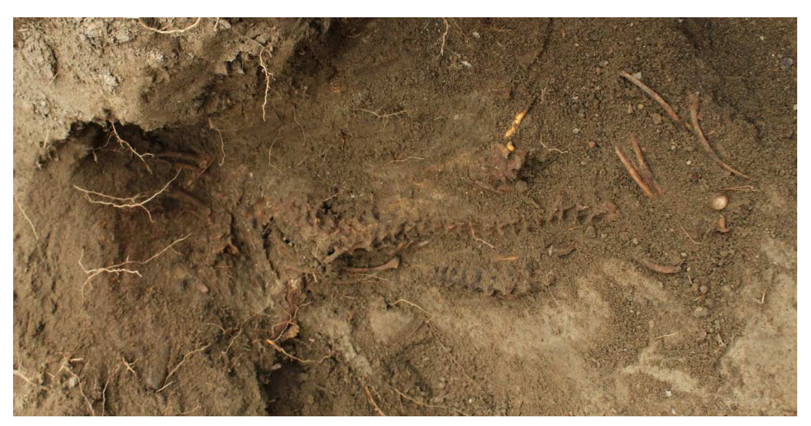
Fig. 4 – The remains of the other animal at the bottom of the pit consisted of 191 vertebrae and 328 ribs, which proved that the animal was not a hare as was first thought when the first ribs of the animal were revealed.