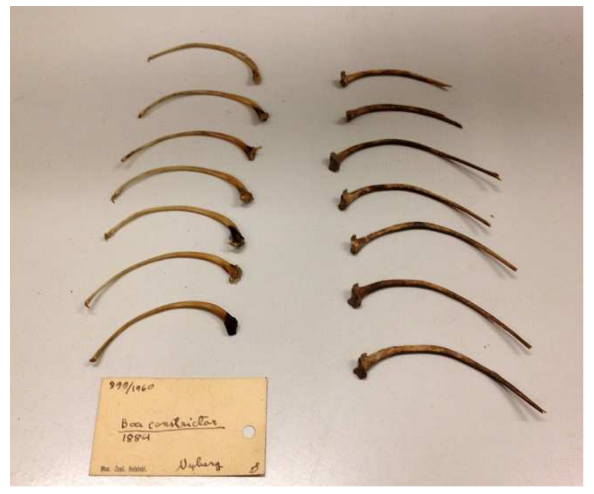
Fig. 5 – The bones of the snake found in excavations (on the right) were compared with Boa constrictor (on the left) donated to the Natural History Museum in Helsinki in 1884.