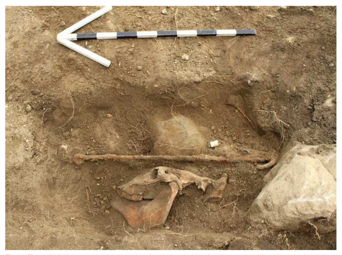
Fig. 3 – The skull of a horse attracted the attention of an archaeologist before the remains of the other animal were found.