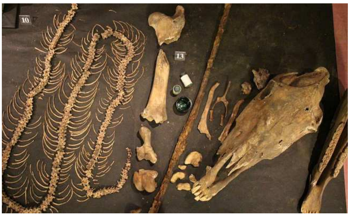
Fig. 8 – The skeleton of the snake and the remains of the horse together with some finds are presented in the exhibition of the Lahti City Museum.

As mentioned above, the main objective of the excavations in Lahti in 2013 was to trace and document the material remains of the village before its destruction in 1877. The burial, however, with its set of objects, was younger and represented the history of the town in the early 20<sup>th</sup> century. Although, the excavations attracted lots of attention all in all, the burial with its strange findings caught special interest in the media, too (e.g. Seura 10, 2014: 28–31). The excavations revealed hundreds of thousands of artefacts, which needed to be valued from different perspectives since only a small part of the findings was kept in the museum collections. After the evaluation, only 14 % of all finds are stored in the collections. The bones are not included in this amount but most of them are discarded. There was no question among the team of archaeologists, however, whether the bones and contents of the pit should not be saved. Today the contents of the pit are represented in the exhibition of Lahti City Museum. (Fig. 8) The set of findings in the showcase may attract the attention of museum visitors and fascinate their imagination, which is not restricted by a ready-made story of this kind offered for the readers of this paper.