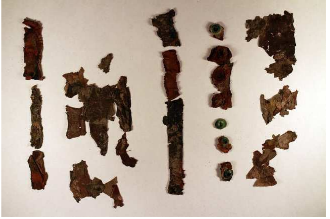
Fig. 7 – The fragments of a painted corset made the find even more intriguing.