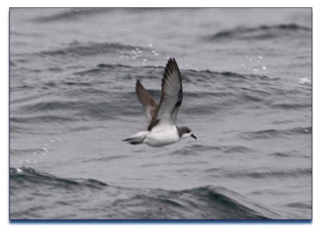
3. Pycroft's Petrel - Mercury Islands, NI New Zealand, December 2009 – note the almost hooded appearance with a partial collar and short, rounded wings.