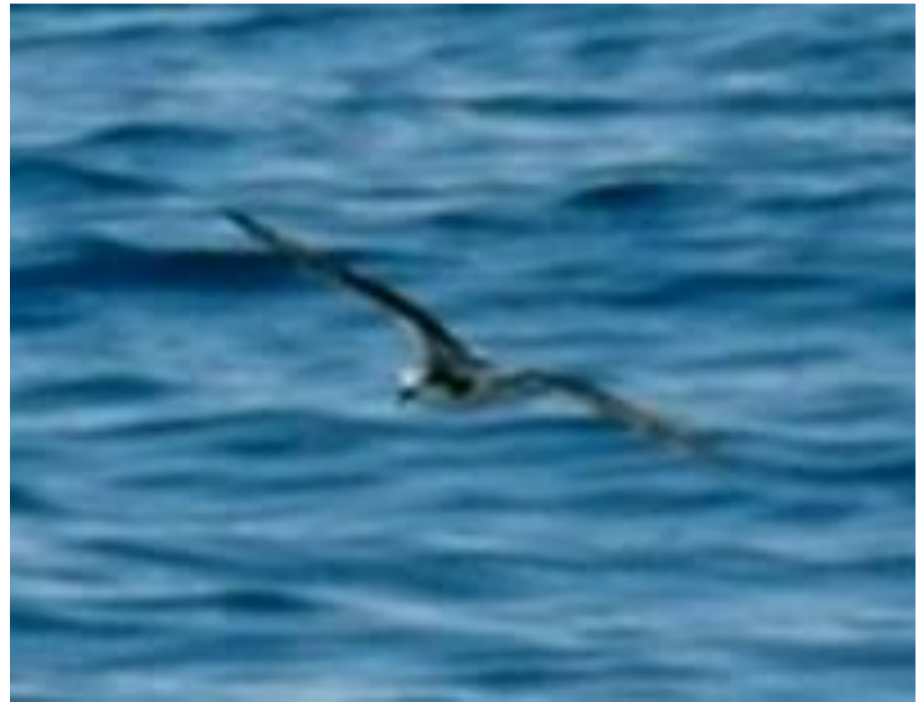
Fig 5. Pycroft's Petrel, Newcastle 2002.