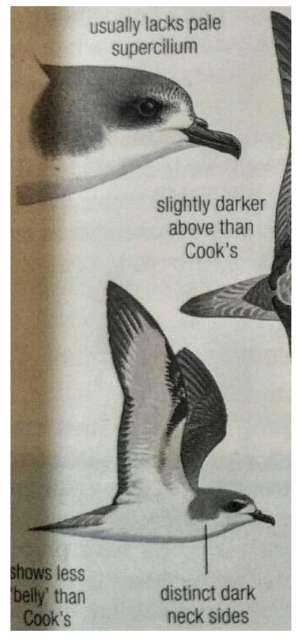
Fig 3 . Pycroft's Petrel, Australian Bird Guide. Illustration by Jeff Davies

Although hard to ascertain with low quality of the photos, it does not appear that the Petrel seen off Newcastle shows any sign of an obvious supercilium. One of the diagnostic traits often discussed between the two species is the lack of obvious supercilium in Pycroft's Petrel. This lack of white supercilium is quite easy to discern even with the low image quality in Figure 2.