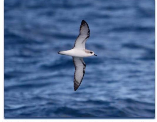
2. Cook's Petrel - Hauraki Gulf, NI New Zealand, December 2009 (Rob Morris) - note the longer looking bill, pale grey head which contrasts with the dark eye patch. The sides of the neck are pale grey and do not form an abrupt angle back to the base of the fore-wing.

Fig 8. Another comparison of the neck, head, eye patch. Photos by Rob Morris 2009, NZ