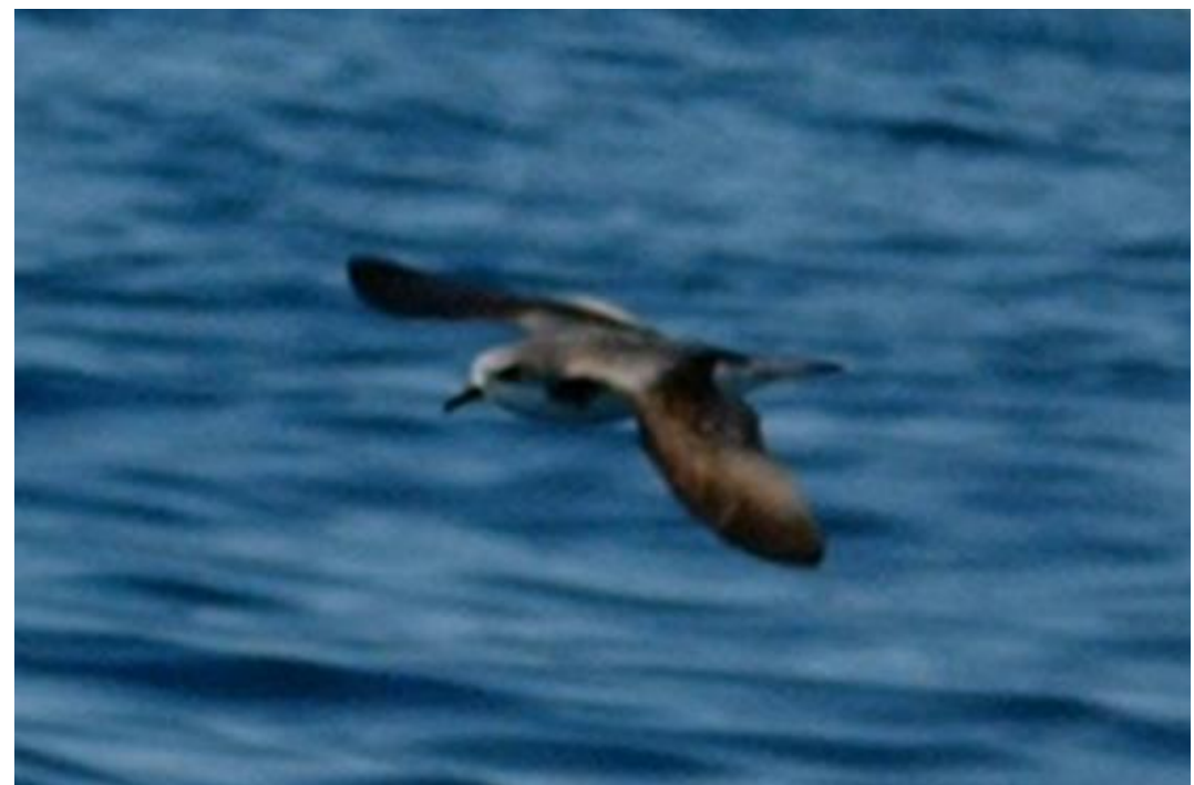
Fig 2. Pycroft's Petrel, Newcastle 2002. Showing triangular shape to large dark eye patch and distinctive dark grey sides to the neck. No sign of supercilium and a rounded looking head with minimal neck.

"Dark ear coverts patch usually appears to merge with crown or often relatively darker and appears as a large oval or triangular patch (with Cook's Petrel this patch is usually smaller but bolder and enhanced by longer and thicker whitish supercilium" (Shirahai, 2005). In figure 2 below the Newcastle bird shows a large triangular shaped eye patch contrasting onto a dusky grey hood.