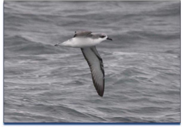
4. Cook's Petrel - Mercury Islands, NI New Zealand, December 2009 (Rob Morris) – note the white supercilium, black eye patch, lack of dark sides to the neck and longer looking wings.

Fig 6/7 . Comparison of grey neck/collar in Pycroft's (above) and Cook's (below). Photos by Rob Morris 2009, NZ.