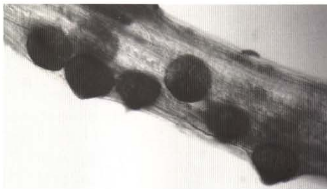
Figure 1. Pseudothecia of Leptosphaerulina australis on a necrotic creeping bentgrass leaf

The previous three descriptions for the classification of species in the genus were based mostly on the size and septation of spores. The most thorough work was performed by Graham and Luttrell (1961), who in addition to spore morphology, described ecology, host specificity, and growth characteristics on artificial media of a number of isolates. They described six species of Leptosphaerulina that occur on forage plants. The number of species in the genus