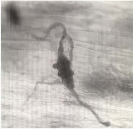
Figure 3. Germinated spore with appressoria (rounded tip on lowest germ tube) on a creeping bentgrass leaf