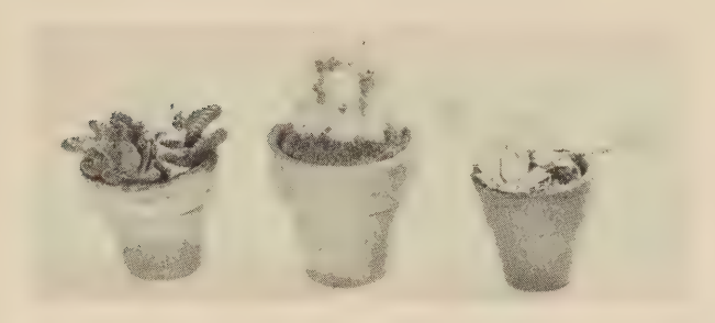
Mammillaria prolifera species Faucaria tigrina Crassula echeveria