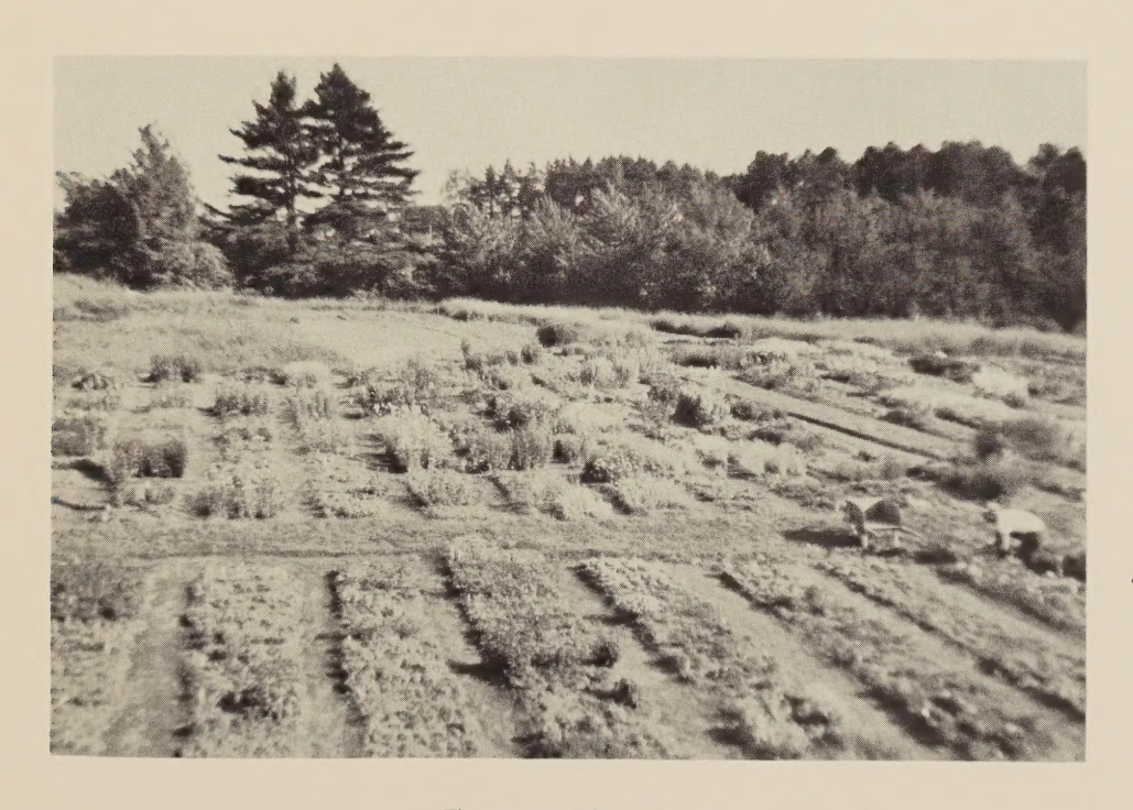
The perennial garden

Prices quoted are for the 2\frac{1}{4} - 2\frac{1}{2} inch pot size plants.