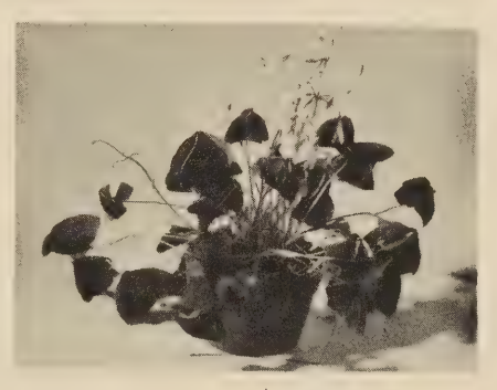
Oxalis rubra alba