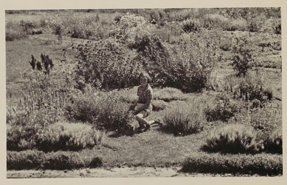
A corner of the Herb Garden