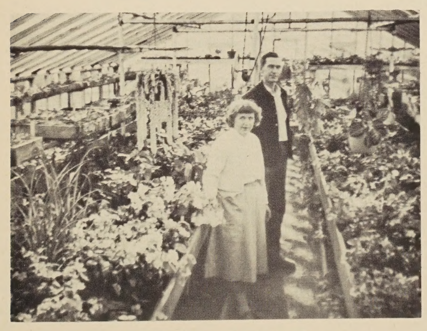
We welcome you from our begonia greenhouse