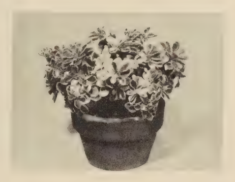
Aichryson domesticum variegated

August to November— 3\frac{1}{2} inch pots in full flower, $1.00 each.