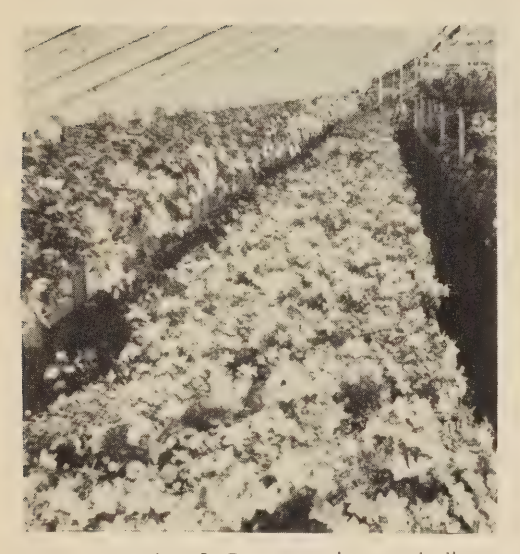
A bench of Campanula isophylla in our greenhouse

MAHERNIA verticillata (Honey Bells)— Small golden bells with the fragrance of Lilyof-the-Valley are produced in early spring and continue into the summer. Our most charming plant. .50