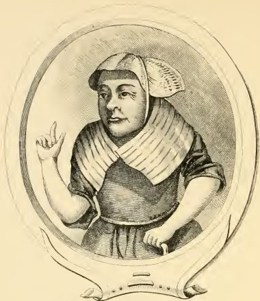
DOLLY PENTREATH MOUSEHOLE