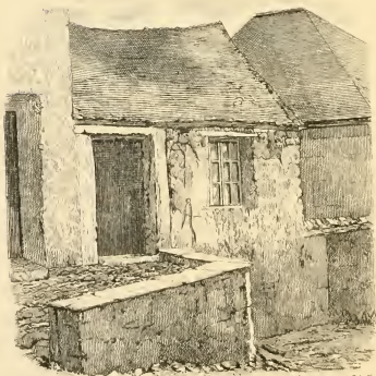
DOLLY PENTREATH'S HOUSE MOUSEHOLE FROM A SKETCH BY MISS MINNIE PAGE 1882