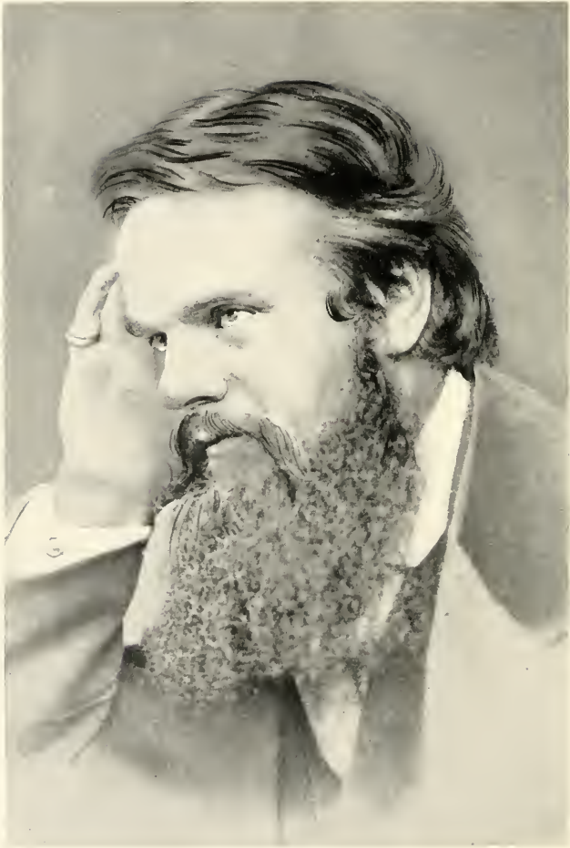
“AND THERE WAS ONLY ONE PRE-RAPHAELITE—THAT WAS MR. HOLMAN HUNT”