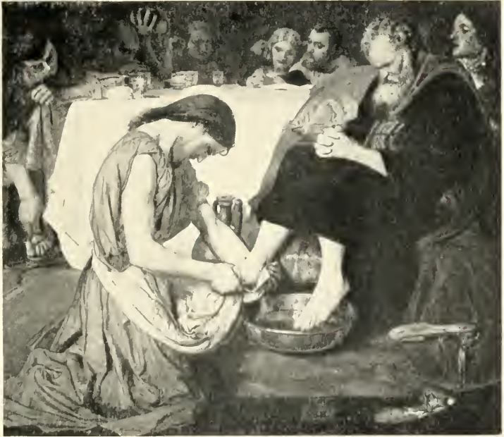
“CHRIST WASHES PETER'S FEET”

(From the picture by Madox Brown in the Tate Gallery)