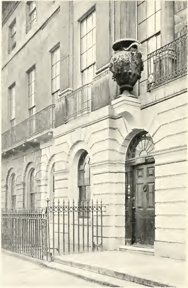
“WITH A FUNERAL URN IN THE CENTRE OF THE ENTRY”