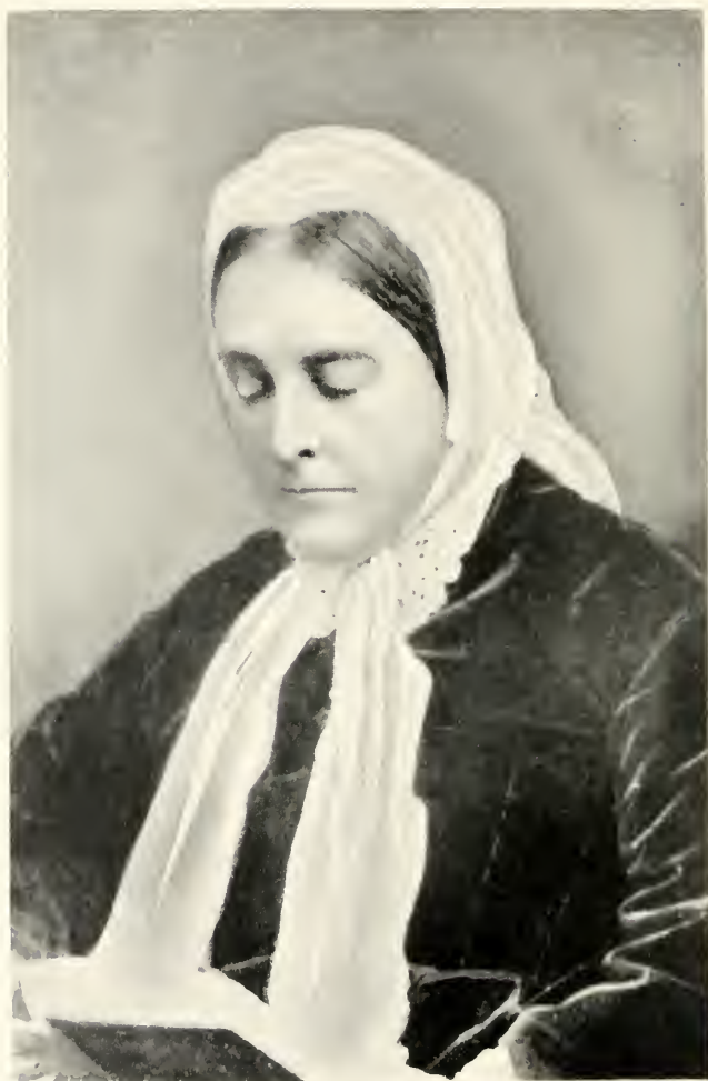
“THE ROSSETTS ALWAYS CIRCLED ROUND BLOOMSBURY.” THE MOTHER OF THE ROSSETTS.