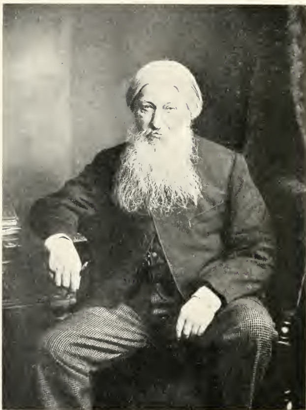
THE LAST LIKENESS OF MADOX BROWN