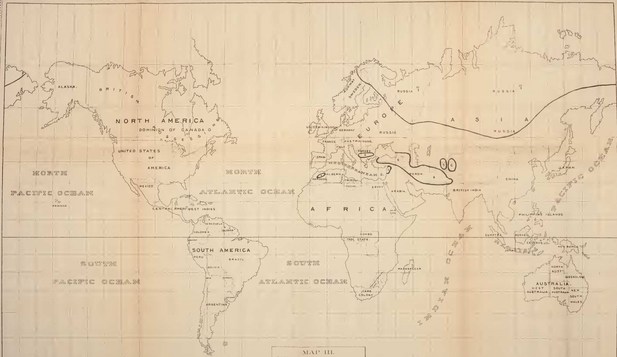
MAP III. BREEDING AREAS OF OLD WORLD OTOCORIS 1. - atlas. 5. - oreodrama. 2. - balcanica. 6. - diluta. 3. - bicornis. 7. - flava. 4. - penicillata.