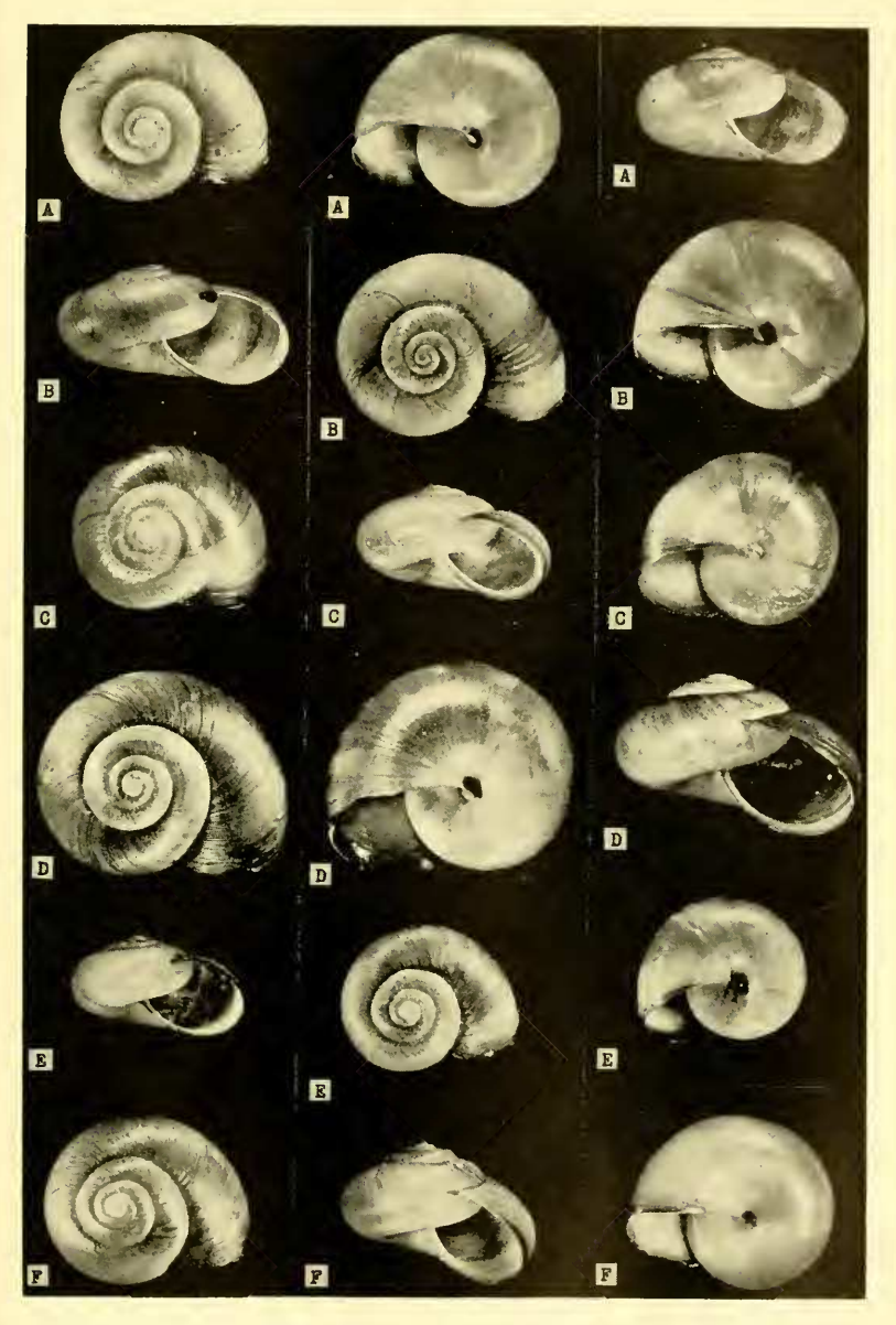
A, Mesomphix vulgatus H. B. Baker. B, M. derochetus Hubricht, holotype. C, M. anurus Hubricht, holotype. D, E. M. globosus (MacMillan). F. M. ruidus Hubricht, paratype.