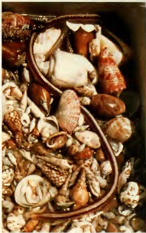
FIGURE 3. Living paratype of Yirrkala moorei sp. nov. (either USNM 306545, 410 mm TL, or ANSP 165122, 375 mm TL) captured by dredge in 42–59 m, Nuku Hiva Id., Hatuatua Bay.