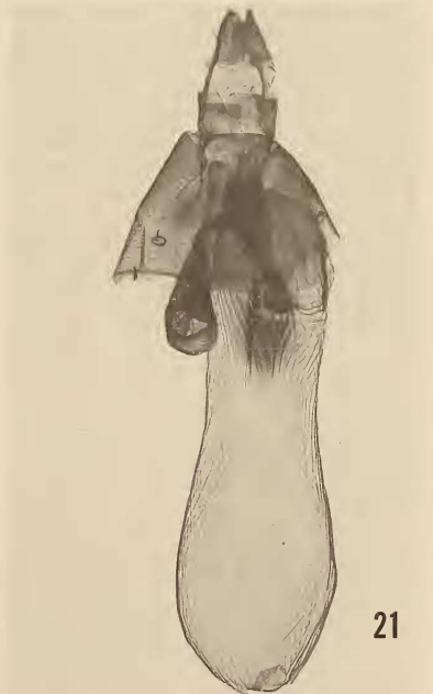
FIGS. 18–21. Bagisara species, ♀ genitalia. 18, B. praecelsa , with modified scale patches of seventh sternum removed. 19, B. praecelsa , with modified scale patches in place. 20, B. gulfare . 21, B. brouana .