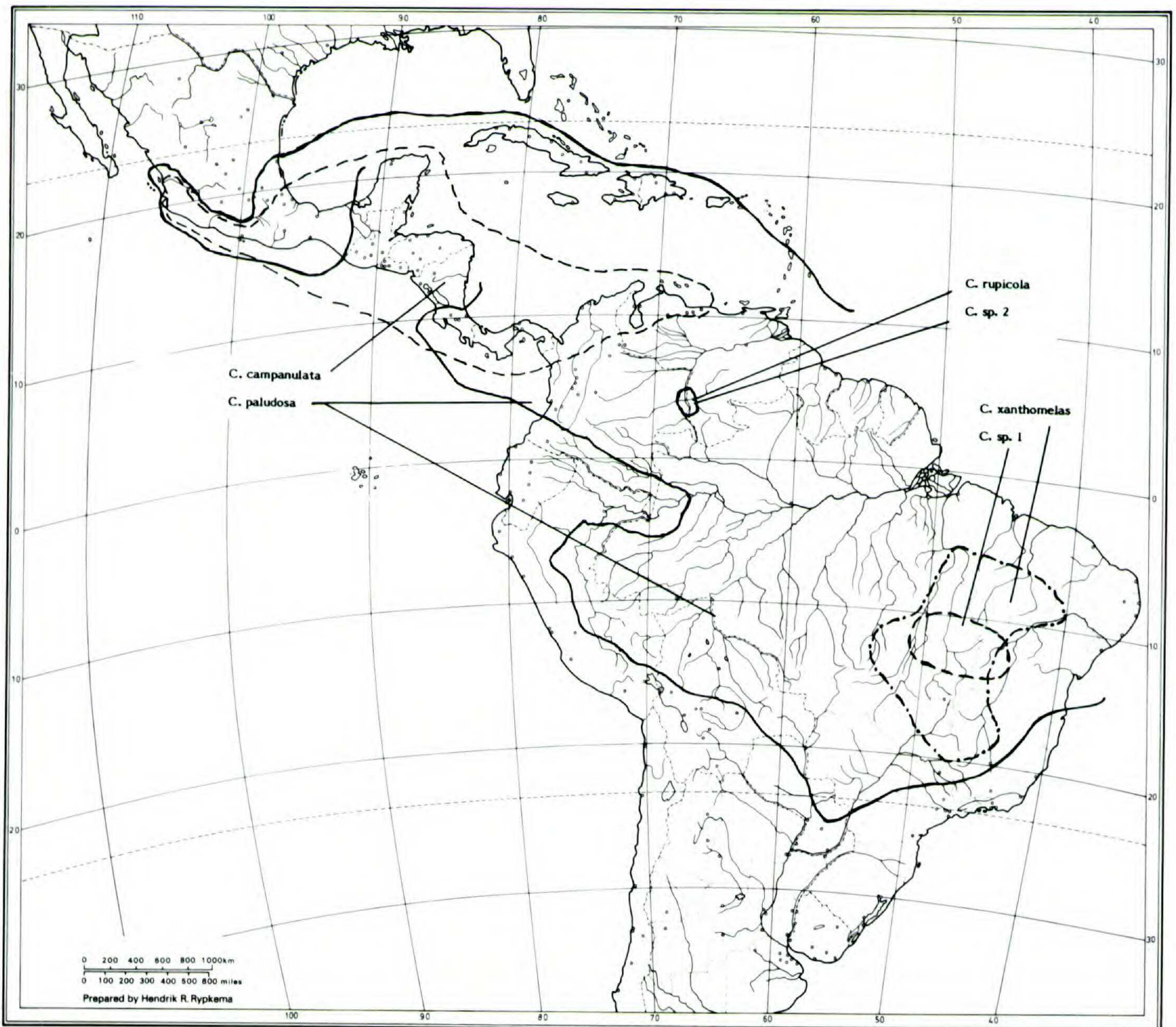
FIGURE 1. Geographical distribution of the species of Cipura . The occurrence of C. paludosa in Nicaragua, Honduras, El Salvador, Guatemala, and the Yucatán Peninsula has not been established. Some specimens from western Mexico are difficult to determine, owing to absence of properly preserved flowers. Both C. campanulata and C. paludosa appear to occur there but more and better preserved material is needed to establish accurately the distribution of Cipura in this area.

dosa ; 2) description of C. rupicola and a discussion of its differences from the closely related C. xanthomelas ; 3) brief discussion of the two violet-flowered species; 4) key to the species; and 5) synonymy and description of C. paludosa .