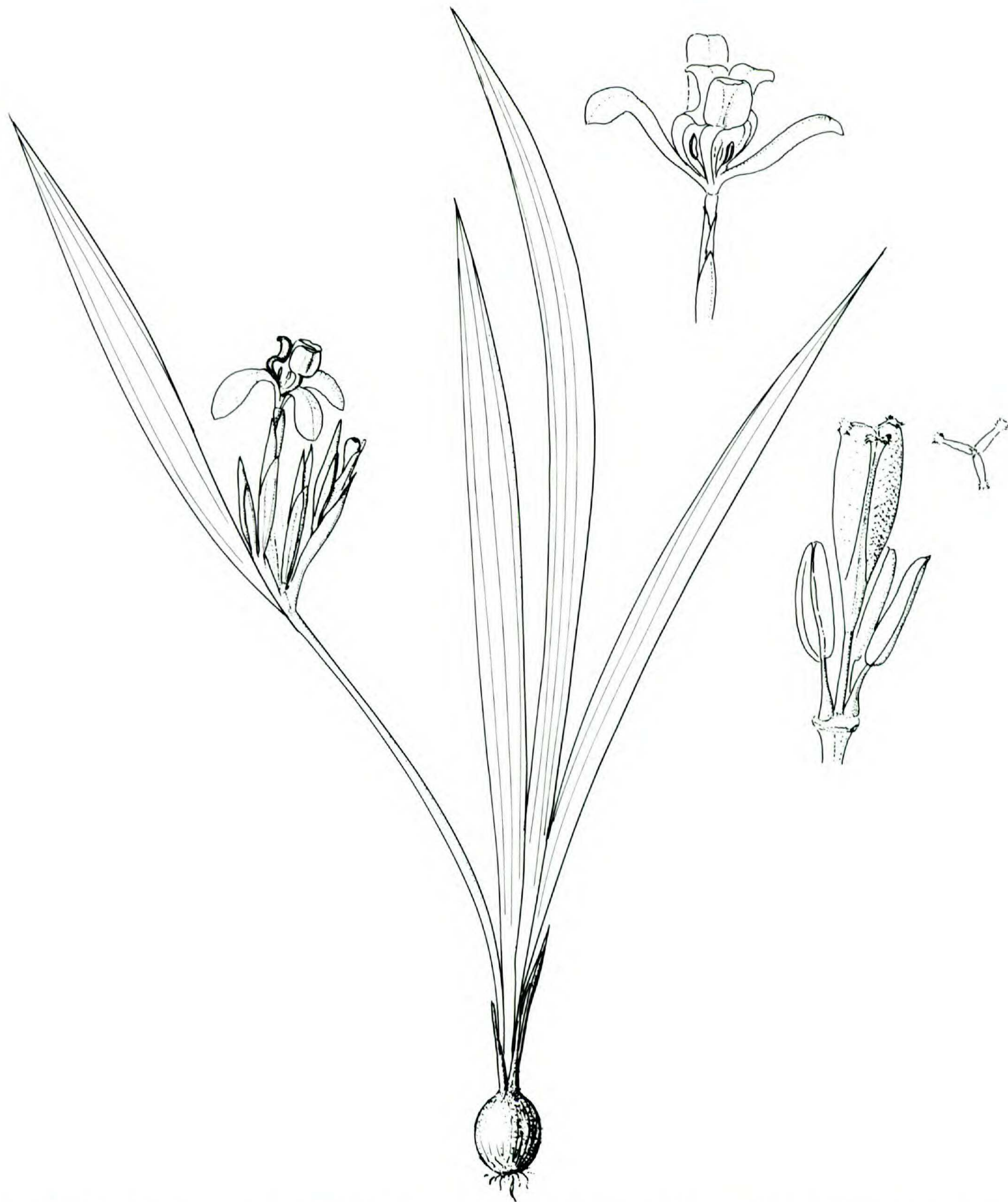
FIGURE 3. Cipura rupicola . Habit ( \times 0.5 ), lateral view of the flower ( \times 1 ), and detail of the stamens and style branches from the side including a dorsal view of the stigmatic region ( \times 4 ).

in some herbaria, is native to Brazil, occurring in Bahia, Goiás, and Mato Grosso. It is easily recognized by the unusually large bulbs with resinous tunics, relatively broad rigid leaves, a short cauline leaf which is typically shorter than the spathes, and only one or sometimes two rhipidia. The flowers are unusual in their violet color and large size. The outer tepals are ca. 40–45 mm