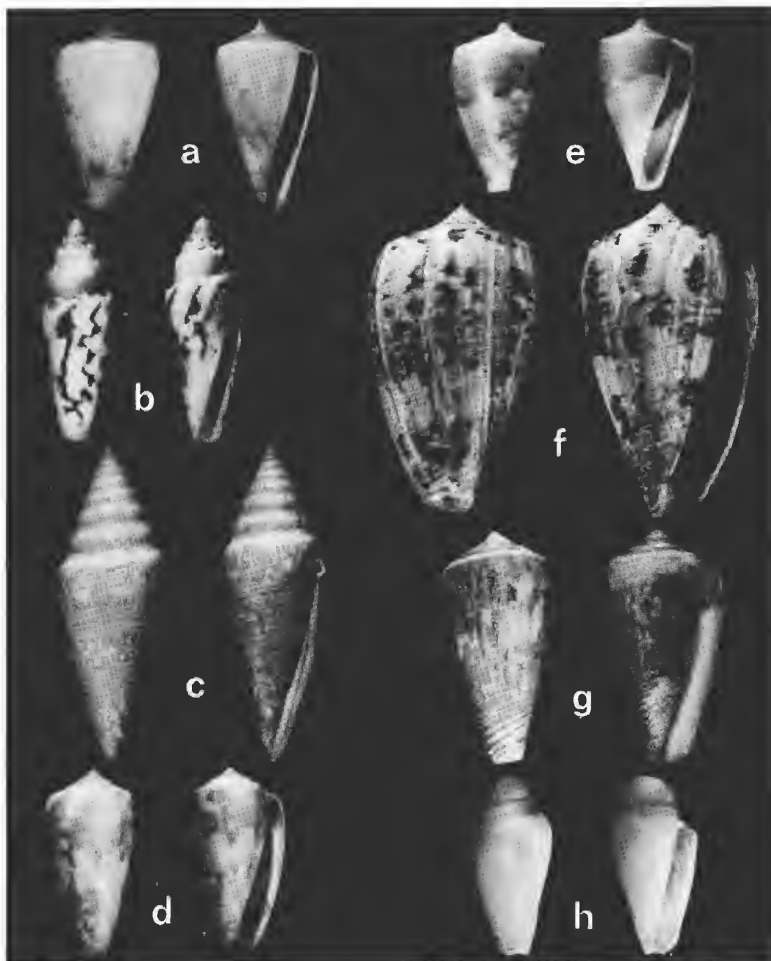
FIG. 2. a. Conus metcalfei , 17.6 × 9.5 mm (×2); b. Kenyonia pulcherrima , holotype 28.0 × 9.4 mm (× 1.5); c. Conus pulcherrimus , holotype 80.0 × 27.2 mm (× 0.5); d. Conus remo , lectotype 35.0 × 17.5 mm (×1); e. Conus rossiteri , ?holotype 10.6 × 6.4 mm (×3); f. Floraconus saundersi , holotype 57.0 × 32.0 mm (×1); g. Floraconus singletoni , holotype 43.5 × 22.0 mm (×1); h. Conus superstes , syntype 3.3 × 1.7 mm (×10).

submarine volcanic eruption; collected in 1878; collector unknown.