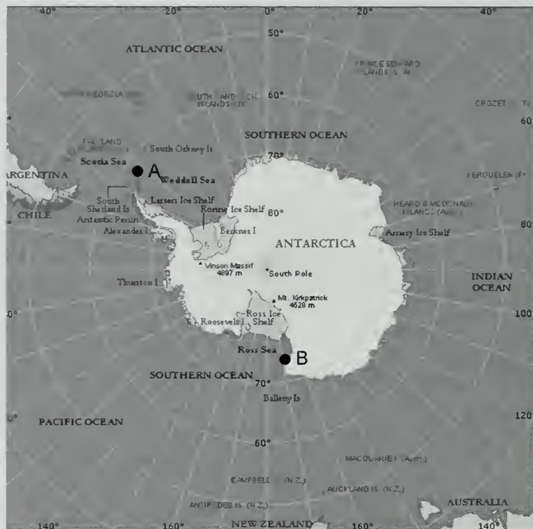
Fig. 10. Distribution map A. Type locality of T. araios n. sp. B. Type locality of T. coulmanensis

Etymology. araios (Greek): thin, weak, slight (from the very thin and weak shell).