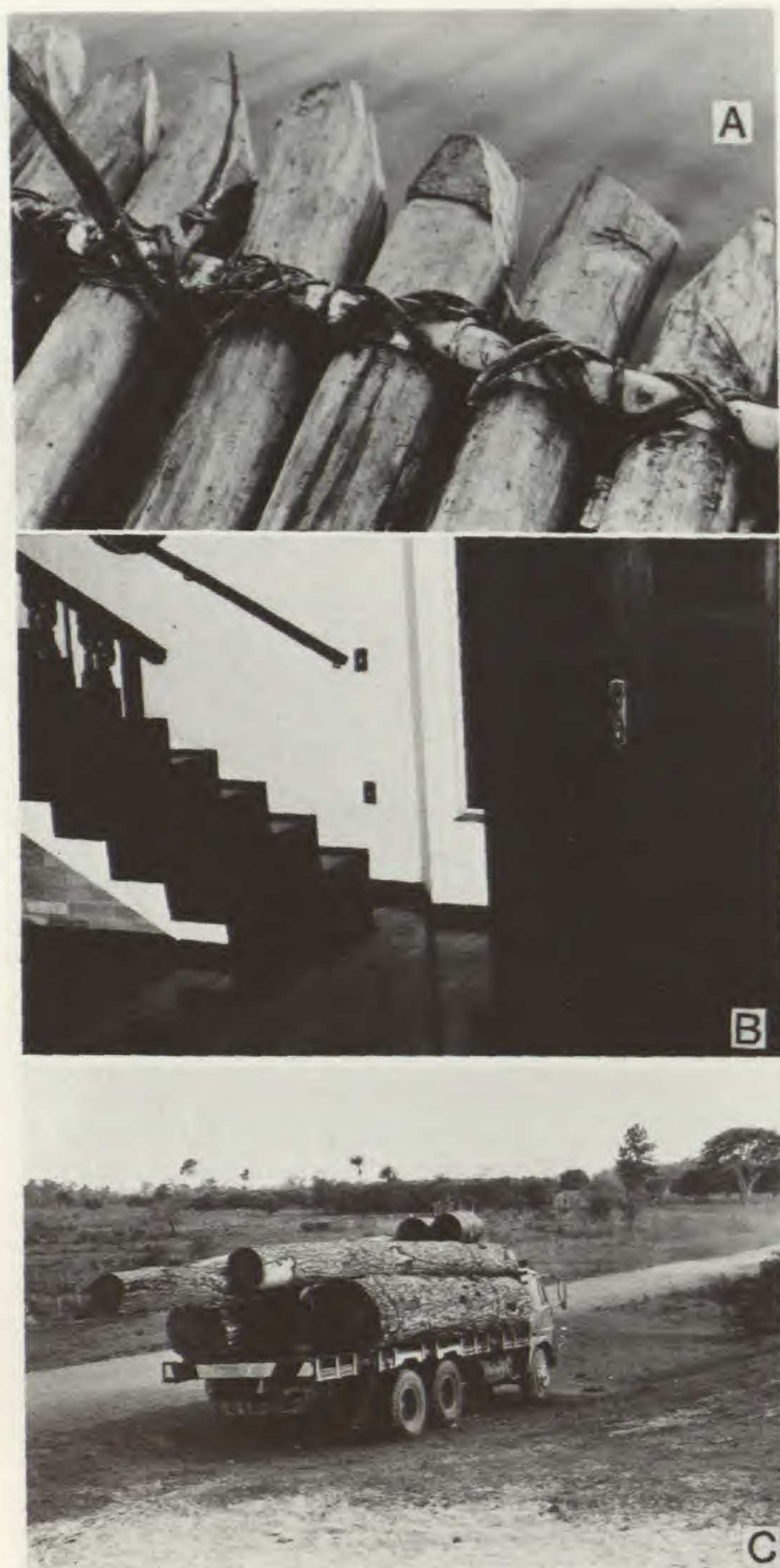
FIGURE 3. Bignoniaceae wood used in construction and cabinetry. —A. Bignoniaceae liana used to tie floating dock together, Mazan, Peru. —B. Interior trim and woodwork of house in Campinas, São Paulo, Brazil, entirely of Tabebuia heptaphylla . —C. Truckload of “lapacho” logs ( Tabebuia heptaphylla ) headed for market in eastern Paraguay.

Don as tools to shape pottery (Vickers & Plowman, 1984). In Africa the fruit of Kigelia is hollowed out to make a kind of mousetrap using a bait and noose; it is also made into ladles, cups, and dolls (Lovett, 1990). The dried fruit valves of Pithecoctenium are frequently placed on a stick (Fig. 2) and used in exotic “floral” arrangements; I once encountered the fruits of the rather rare Amphilophium pannosum (DC.) Bureau & K. Schumann similarly displayed in Germany, though how they had arrived there is anybody’s guess.