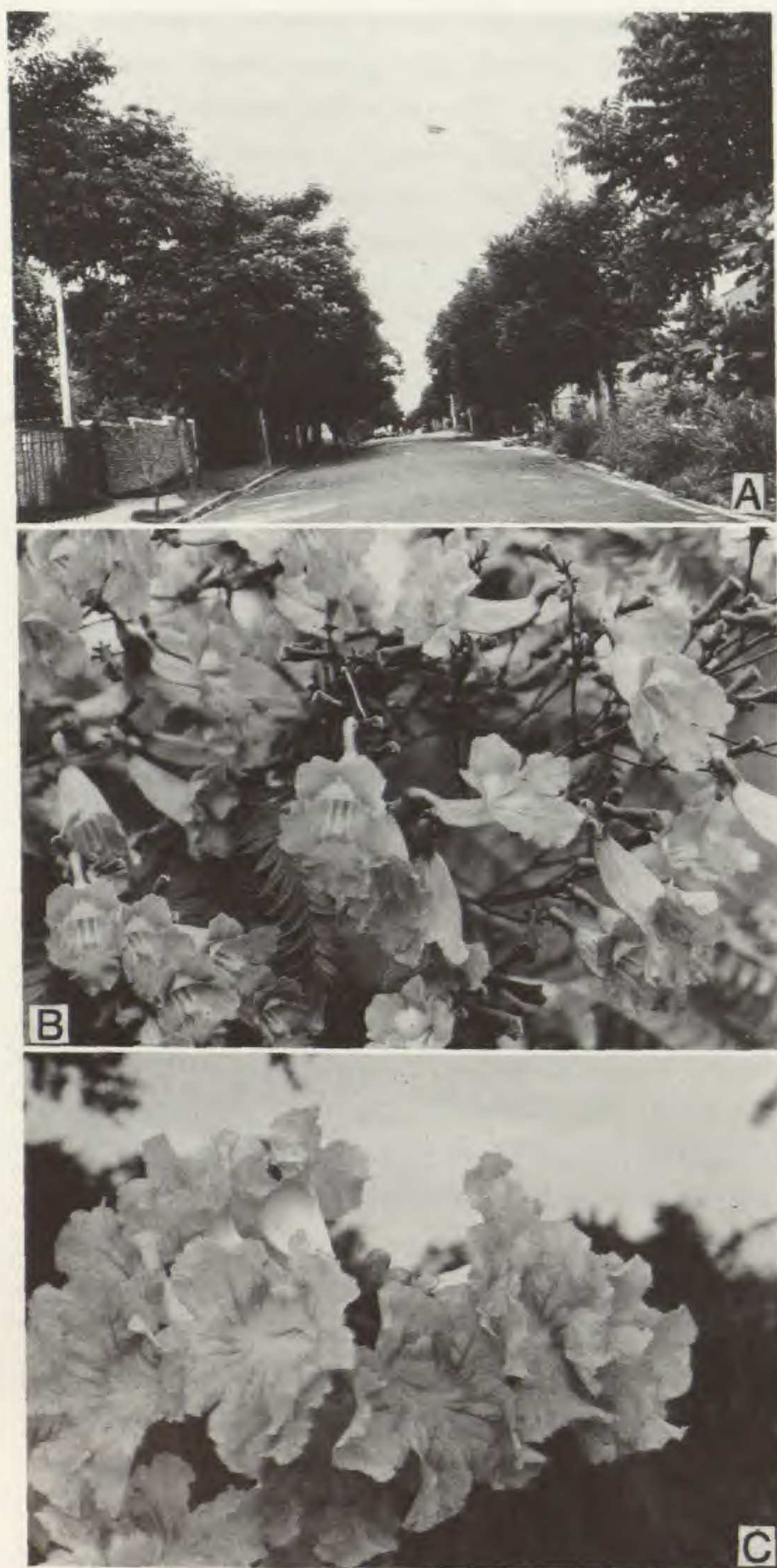
FIGURE 1. Bignoniaceae used in horticulture.—A. Street in Campinas, São Paulo, Brazil, lined entirely with Spathodea campanulata .—B. Jacaranda mimosifolia , perhaps the most widely cultivated flowering subtropical tree in the world.—C. Tabebuia rosea , national tree of El Salvador, widely cultivated throughout the world's tropics.