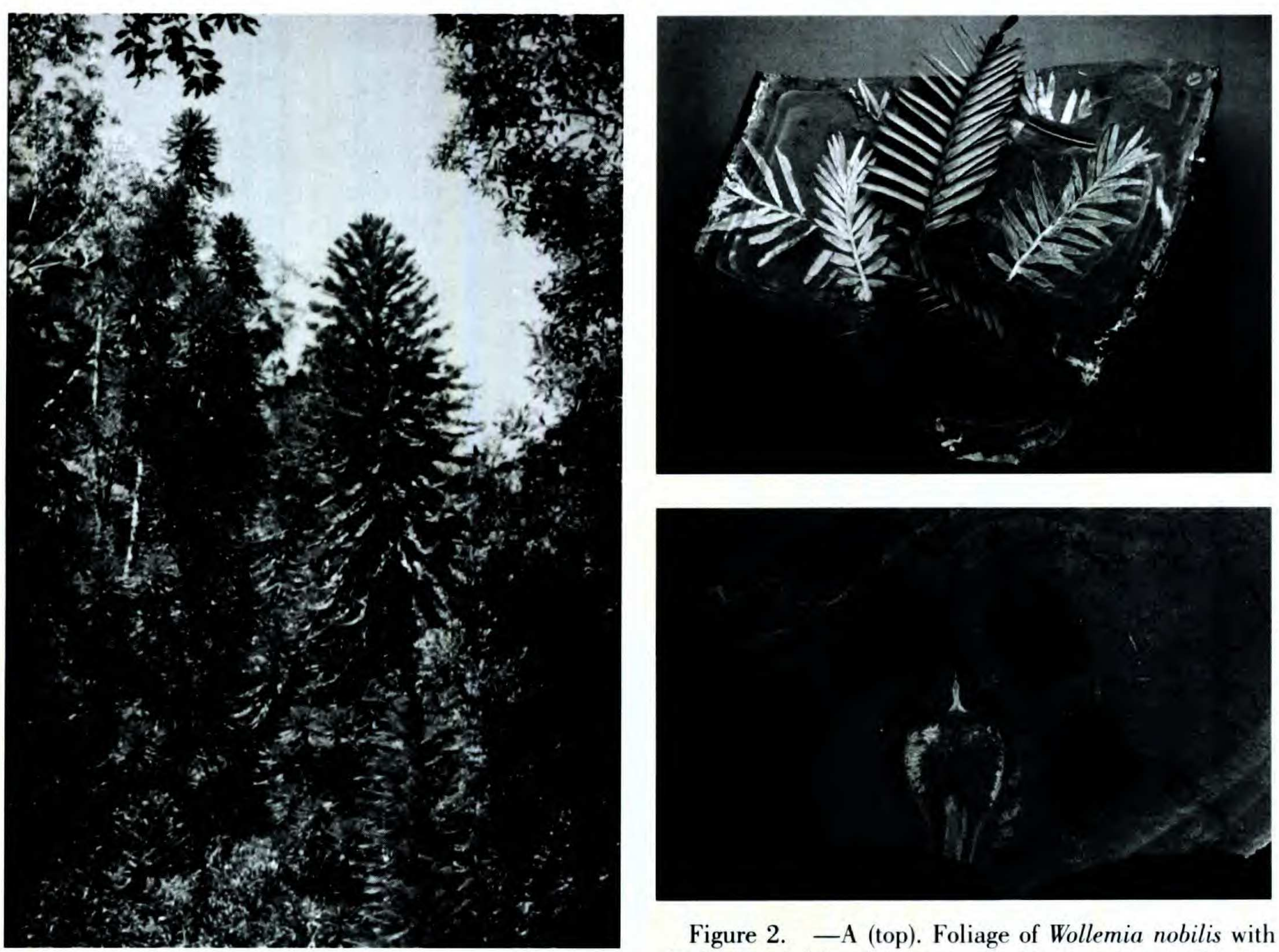
Figure 1. Wollemia nobilis in its natural habitat.

(Gilmore & Hill, 1997; Setoguchi et al., 1998). Before the discovery of Wollemia , the family was known from South America, New Zealand, northeastern Australia, New Guinea, and, in especially rich diversity, in New Caledonia. Two extant genera had been recognized, Araucaria and Agathis .