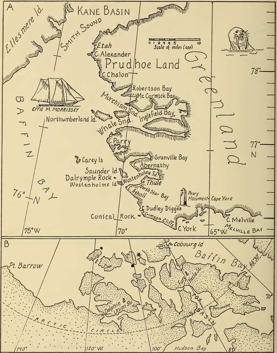
Fig. 1.—A, Detail of NW. Greenland, showing localities represented in the Bartlett collections; B, The American Arctic (only those localities from which pycnogonids have been collected are indicated). *Type locality of Boreonymphon robustum (approximate); probably also of Nymphon hirtipes . ●Type locality of Colossendeis proboscidea (approximate).