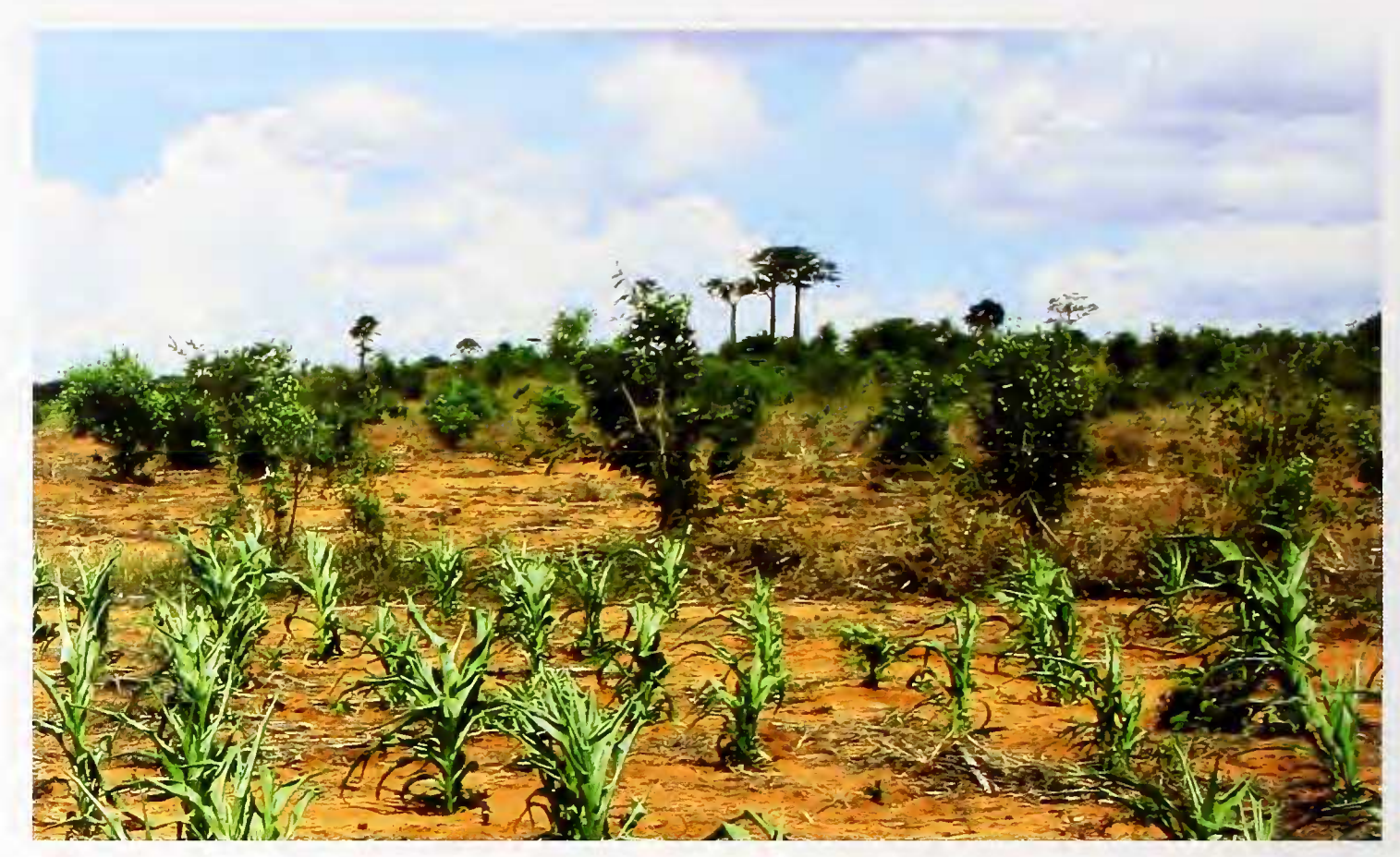
Fig. 1. Habitat of Voeltzkowia rubrocaudata : corn plantation (in foreground) near the village of Andranomaitso, Commune rurale de Sakaraha.